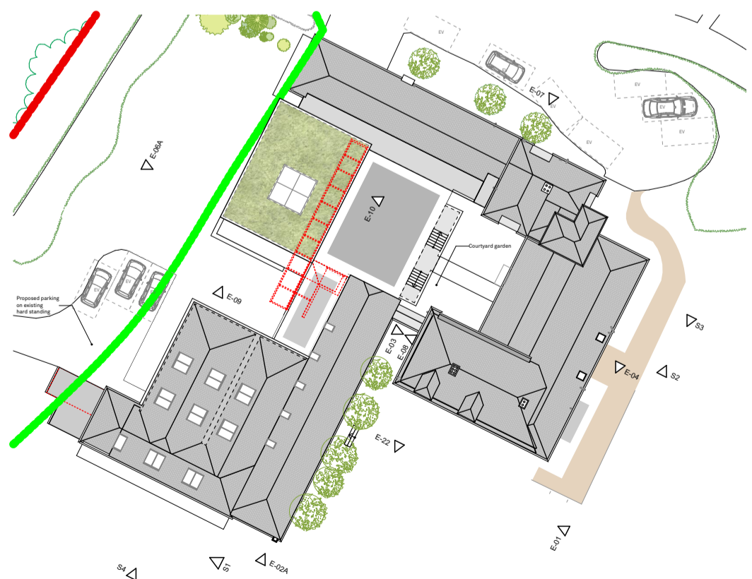
Elevation Key proposed