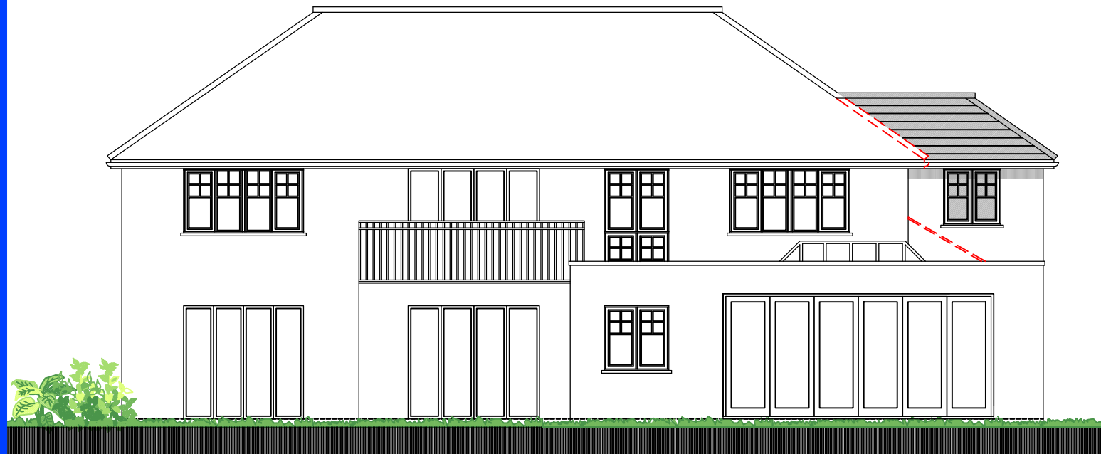
WEST ELEVATION AS PROPOSED