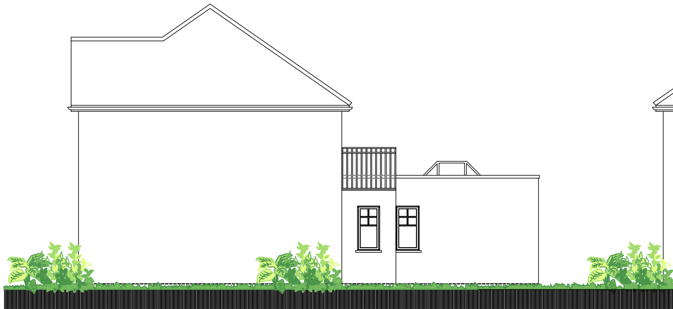
SOUTH ELEVATION AS EXISTING