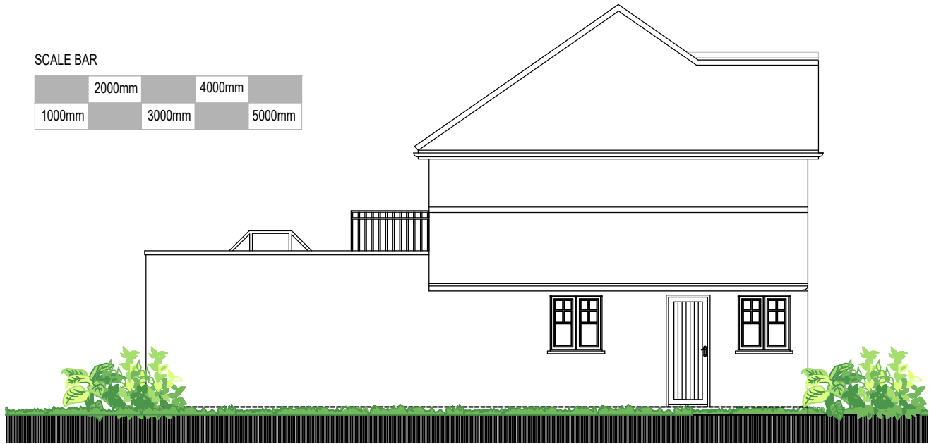
NORTH ELEVATION AS EXISTING