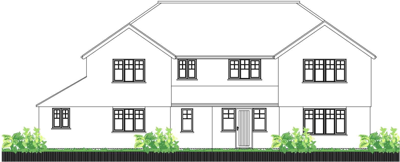
EAST ELEVATION AS EXISTING