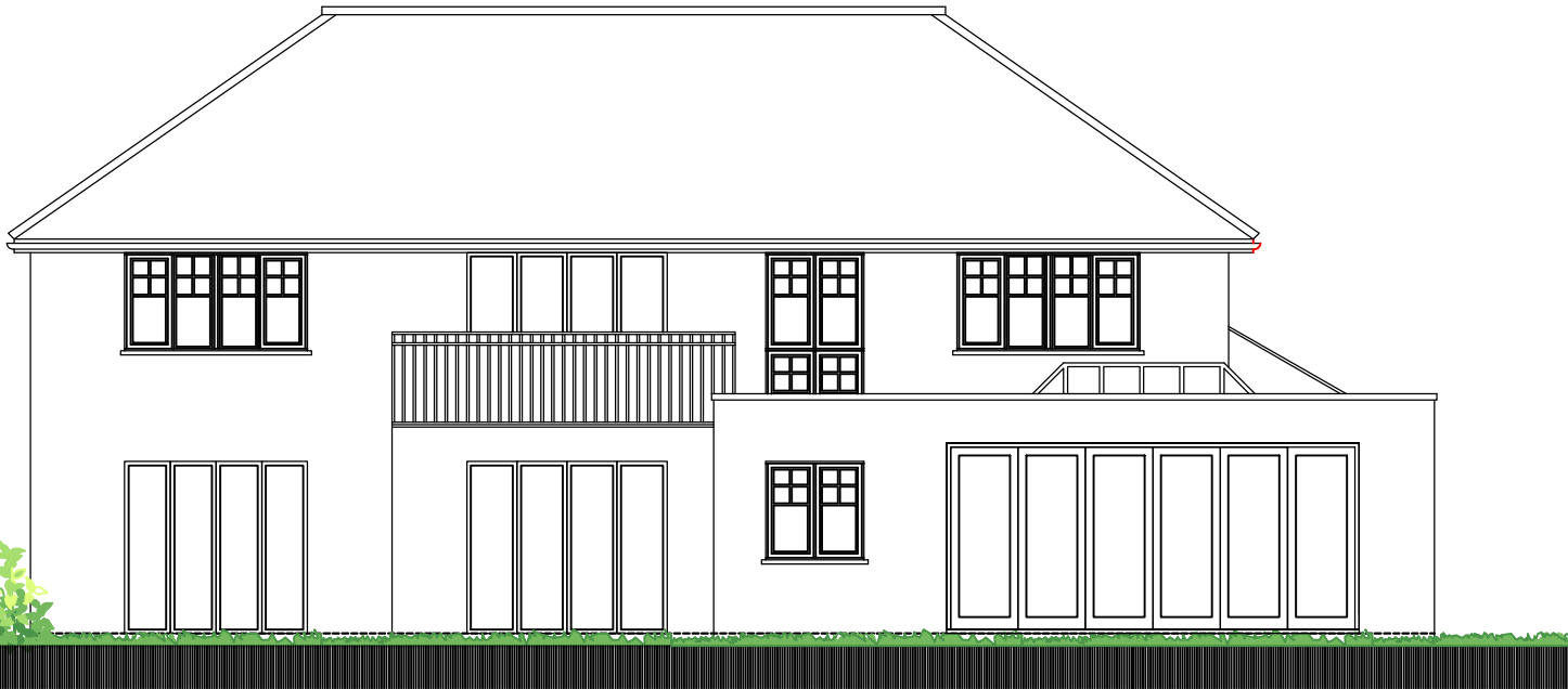
WEST ELEVATION AS EXISTING