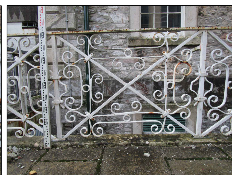
EXISTING FENCE PANEL