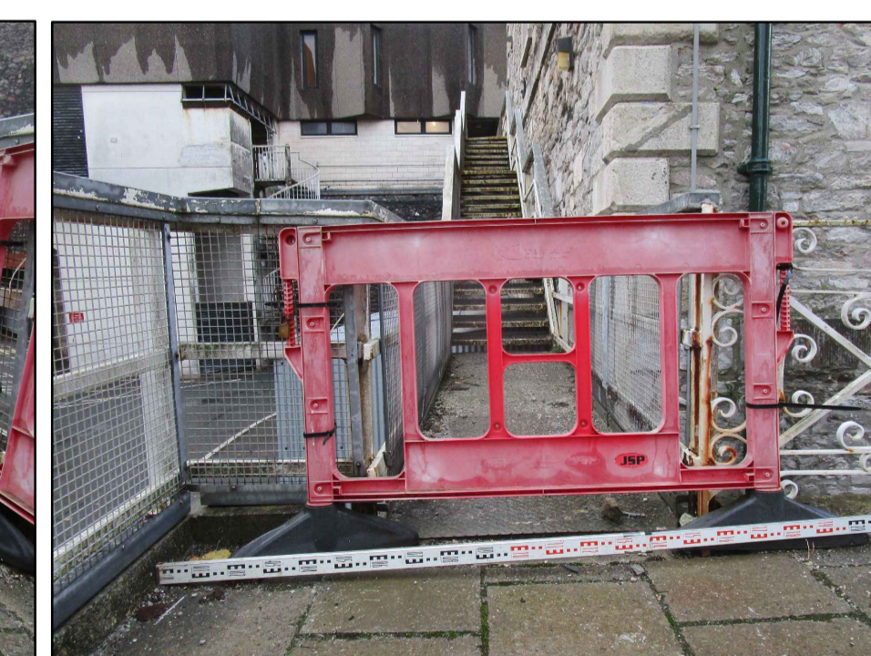
EXISTING OPENING AT BASE OF GANTRY TO BE PROVIDED WITH FENCE PANEL TO MATCH EXISTING LISTED FENCING