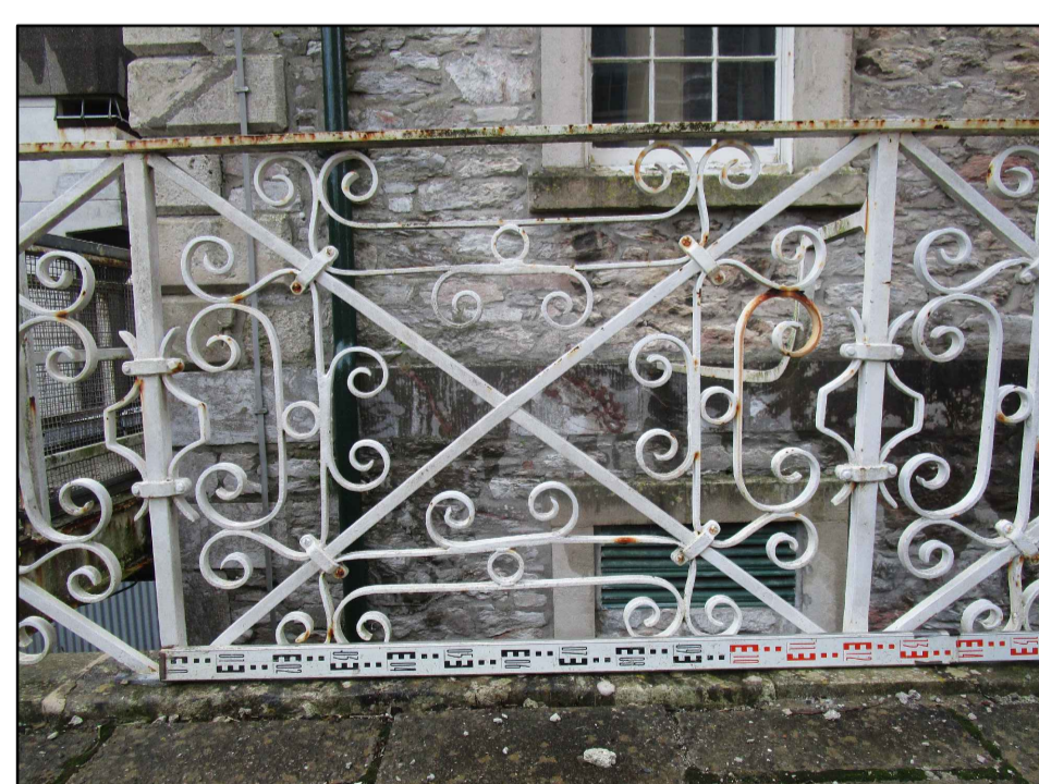
EXISTING FENCE PANEL