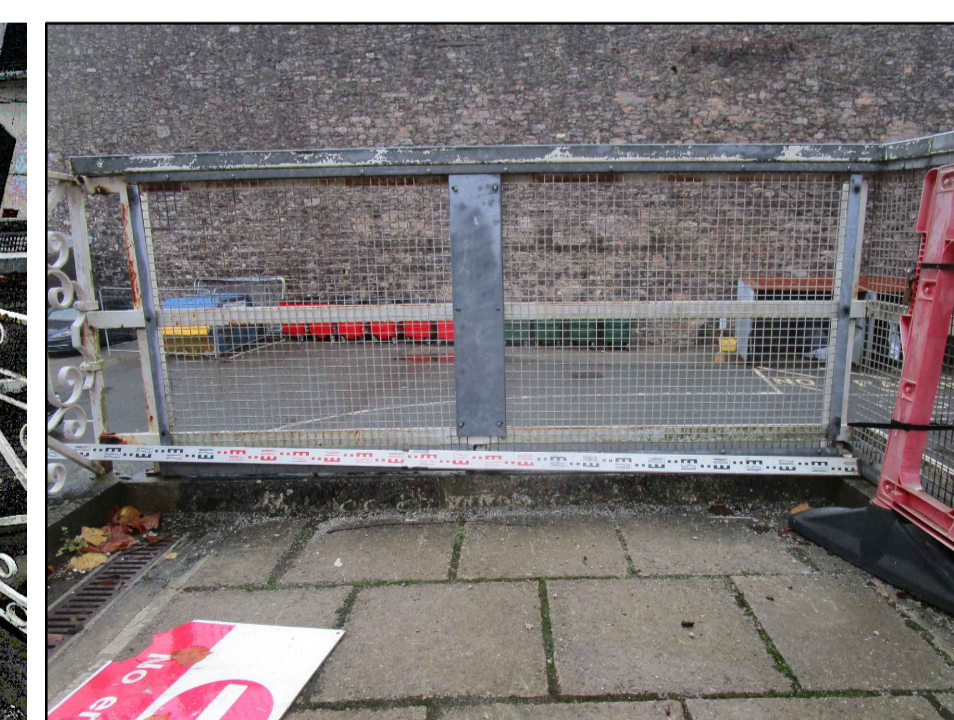
EXISTING FENCE PANEL TO BE REPLACED TO MATCH EXISTING LISTED FENCING