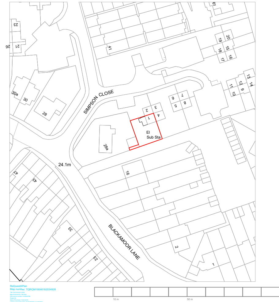
LOCATION PLAN 1.1250