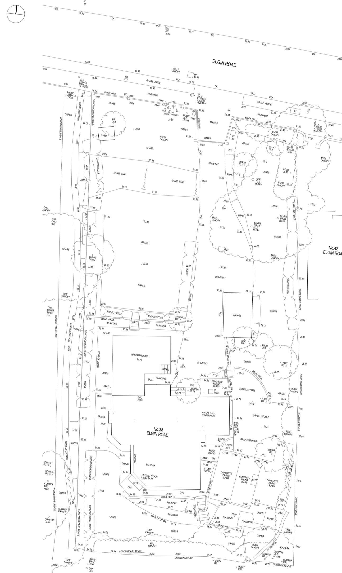
Topographical Survey Scale (A1): 1:200