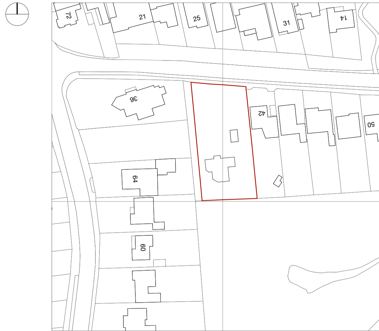
Location Plan Scale (A1): 1:1000