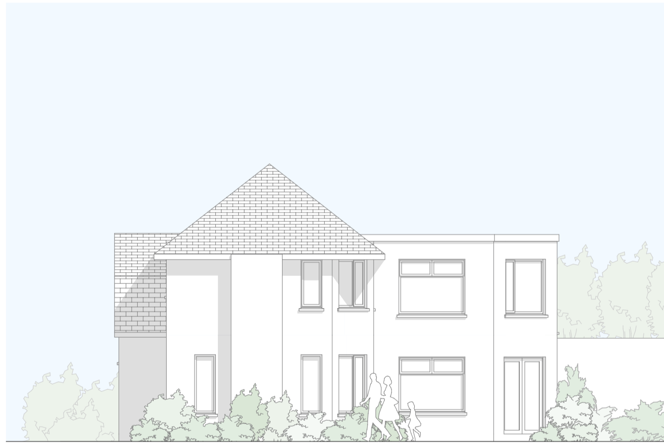
Proposed Side Elevation Scale (A1): 1:100