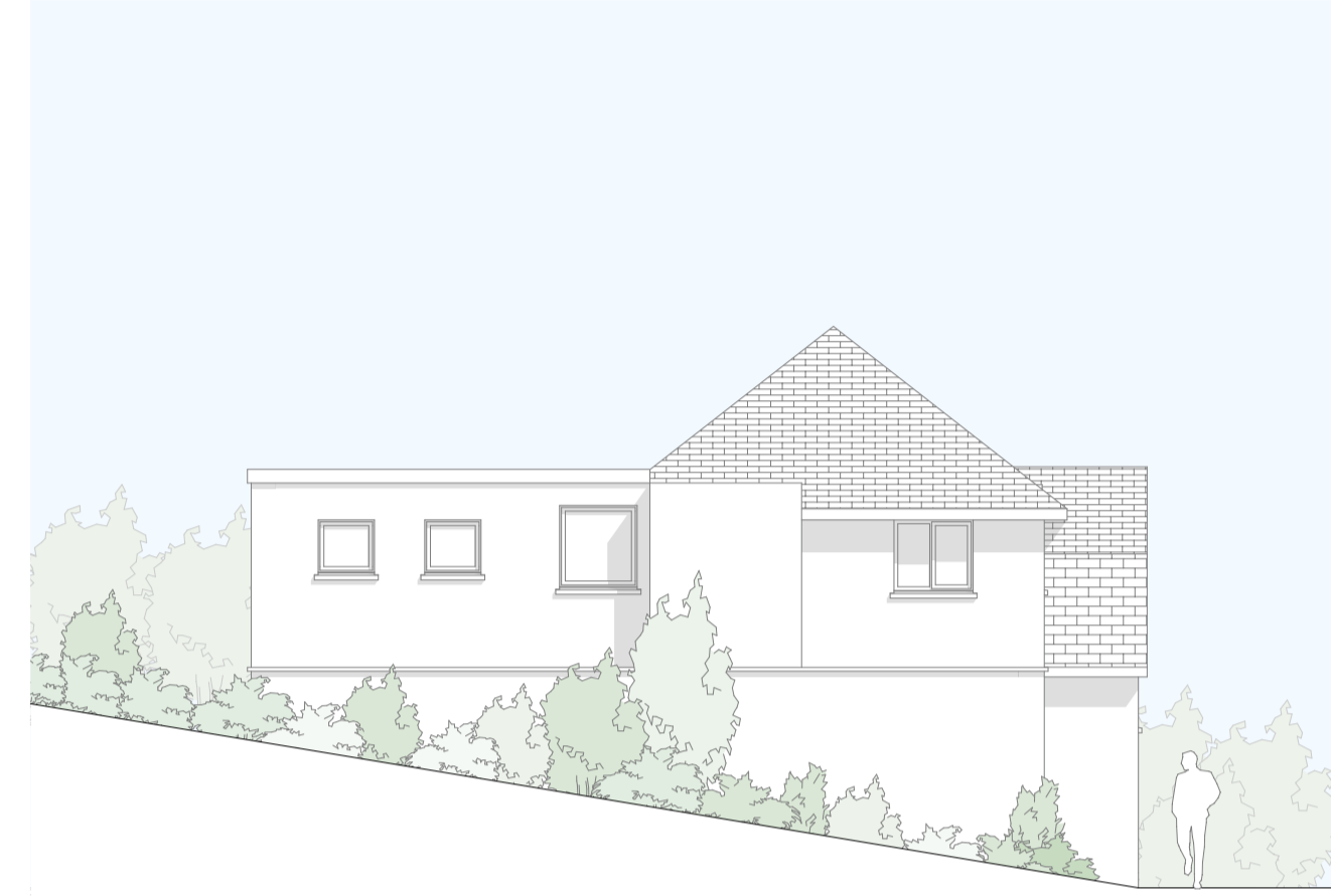
Remodelled Dwelling - Side Elevation Scale (A1): 1:100