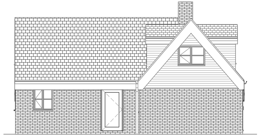
3 Proposed East Elevation 1 : 100