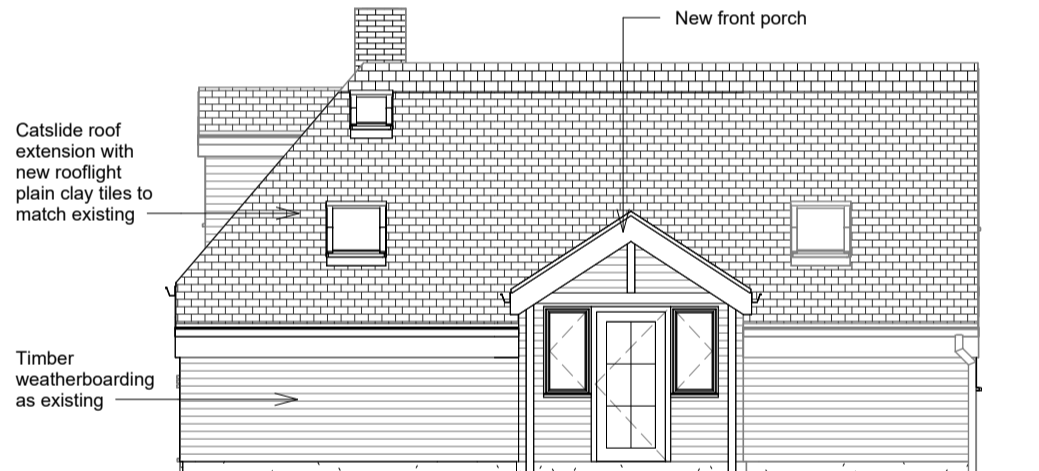
4 Proposed West Elevation 1 : 100