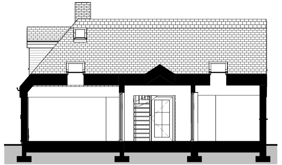
B Proposed Section 1 : 100