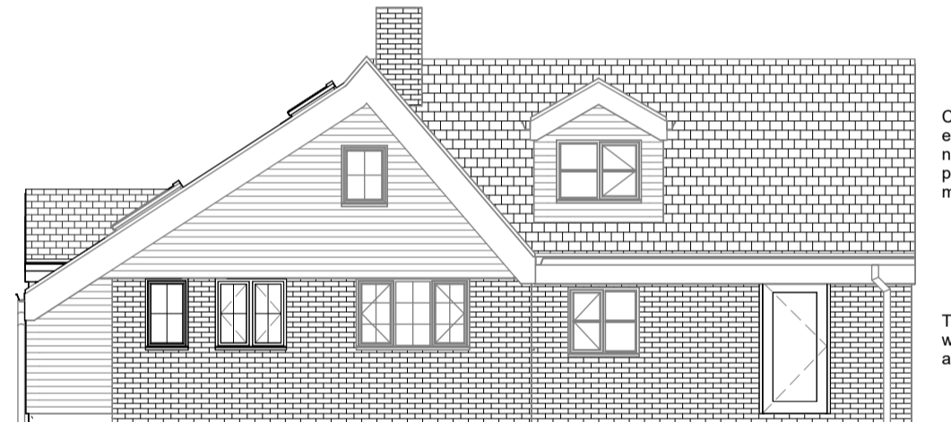
2 Proposed South Elevation 1 : 100