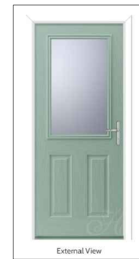
External View Mulsanne Composite door from Hallmark Doors and Panels Ltd finished in Chartwell Green