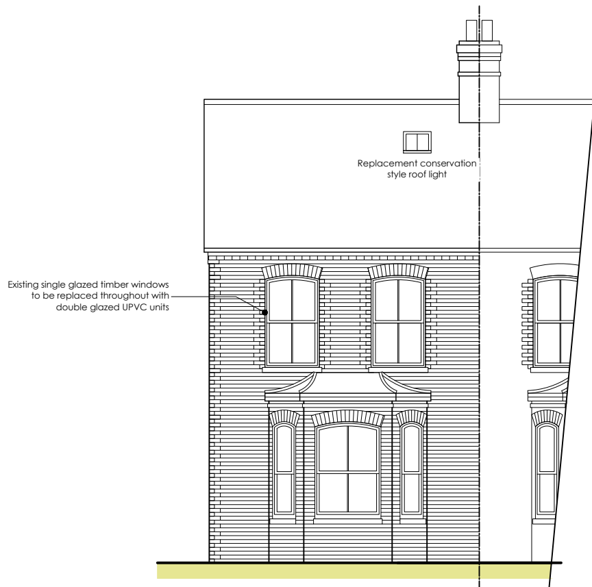
front - west