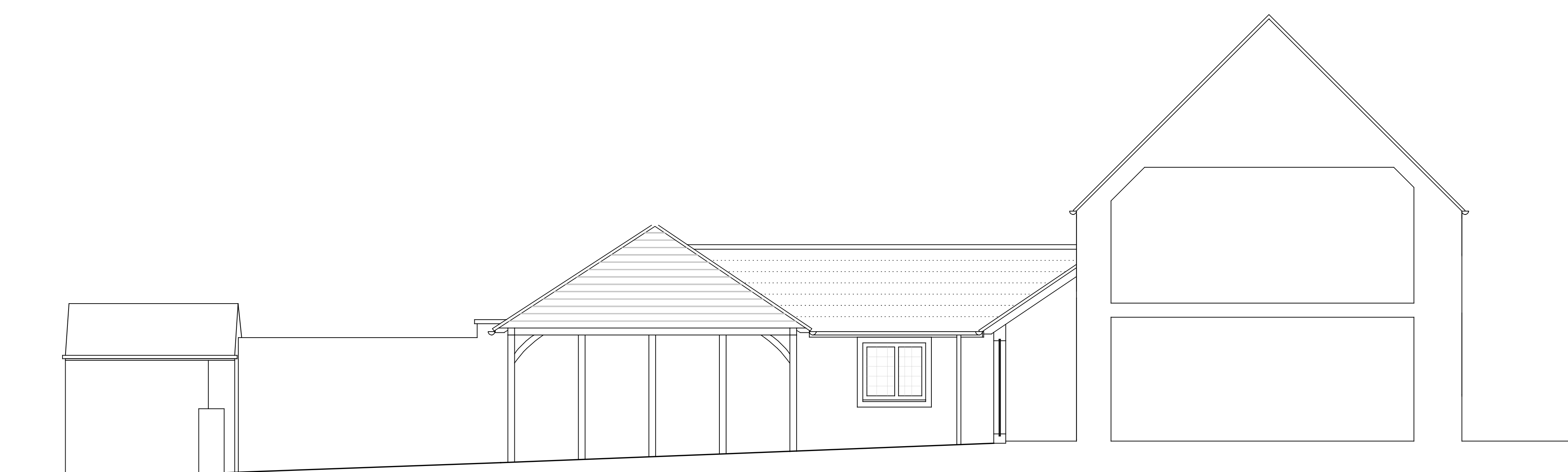
SIDE ELEVATION SCALE 1:50