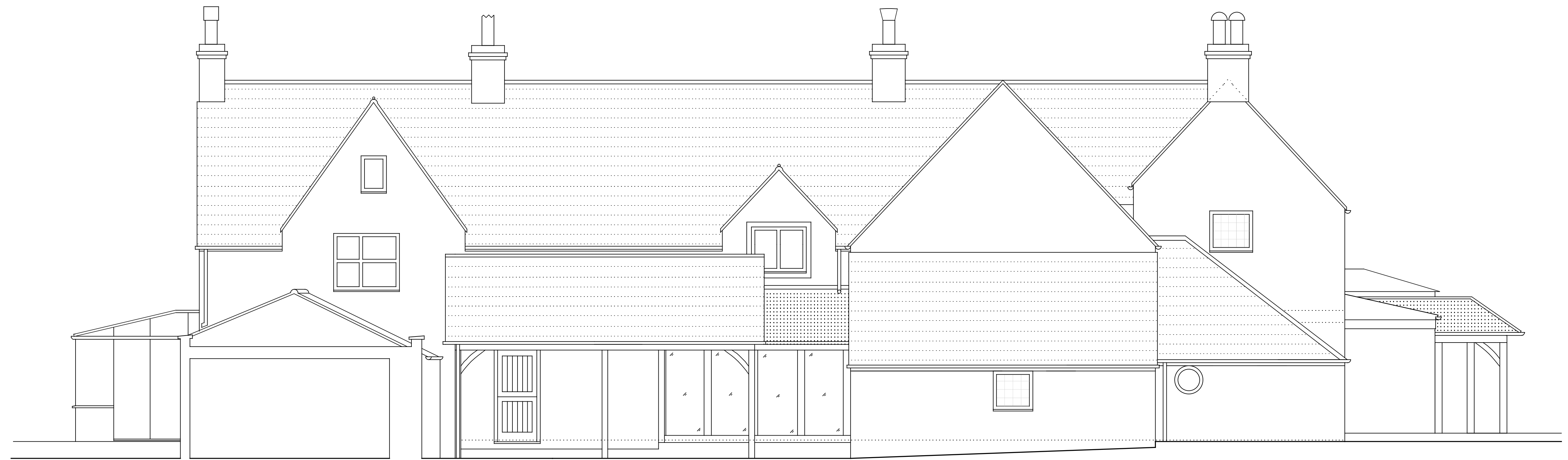
REAR ELEVATION SCALE 1:50