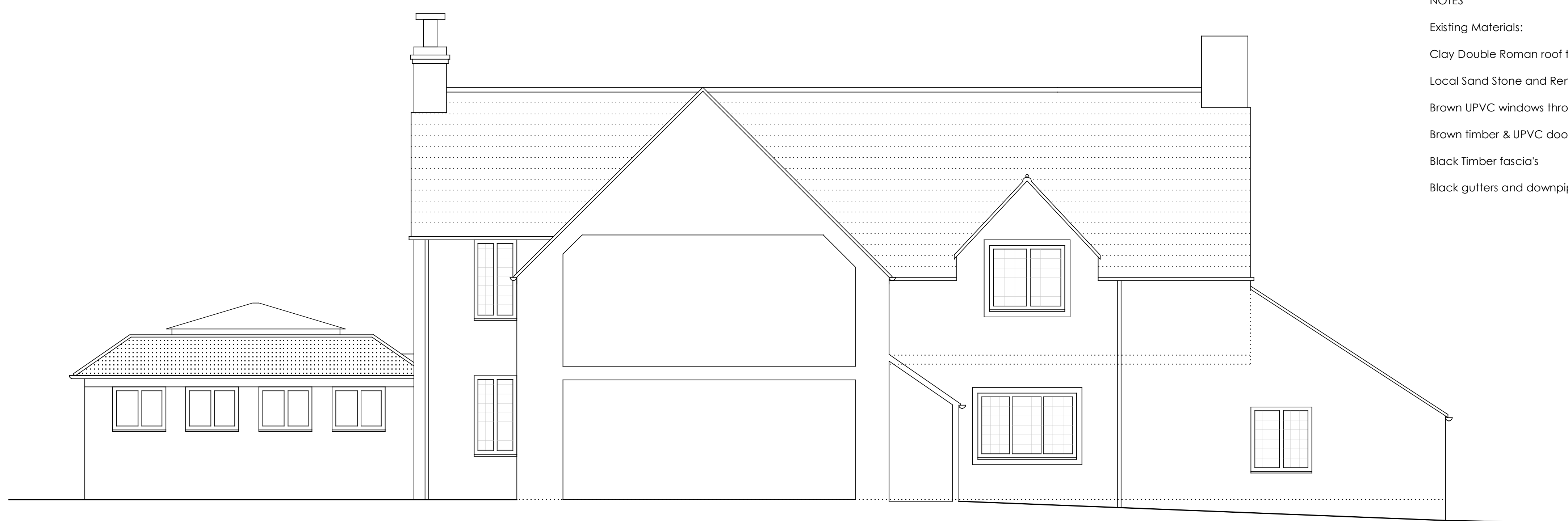
SIDE ELEVATION SCALE 1:50