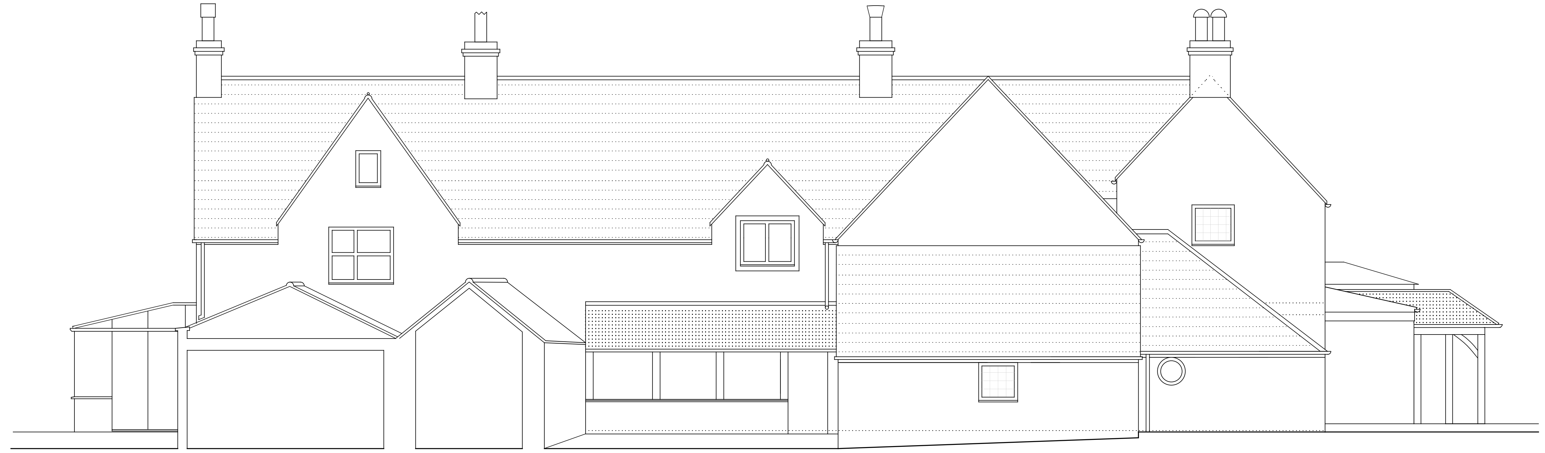
REAR ELEVATION SCALE 1:50