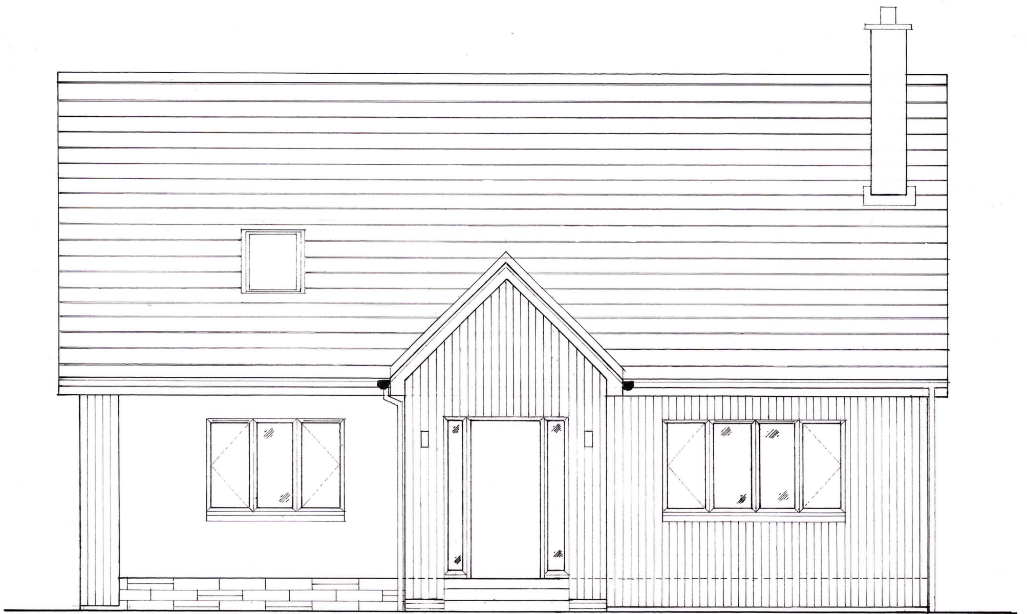
FRONT ELEVATION as PROPOSED 1:50