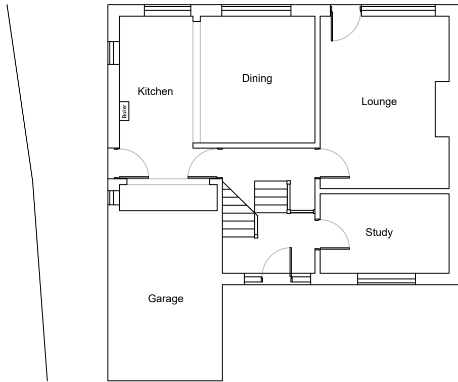
Existing Ground Floor