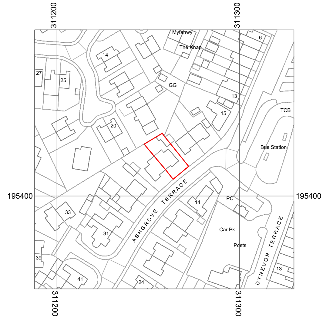
1: 1250 SITE LOCATION PLAN

© Crown Copyright and database rights 2023 OS 100047474.