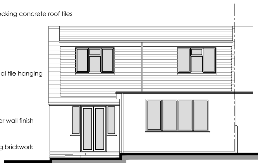
Proposed (Rear) North East Elevation

Interlocking concrete roof tiles Vertical tile hanging Render wall finish Facing brickwork