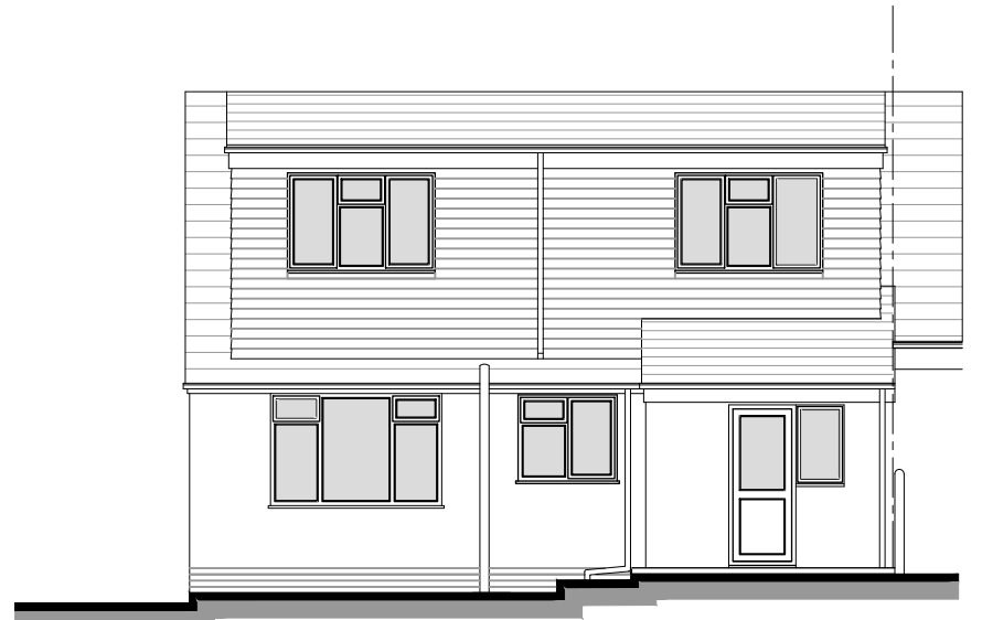
Existing (Rear) North East Elevation

Interlocking concrete roof tiles Render wall finish Facing brickwork