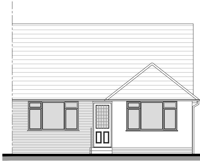
Existing (Front) South East Elevation