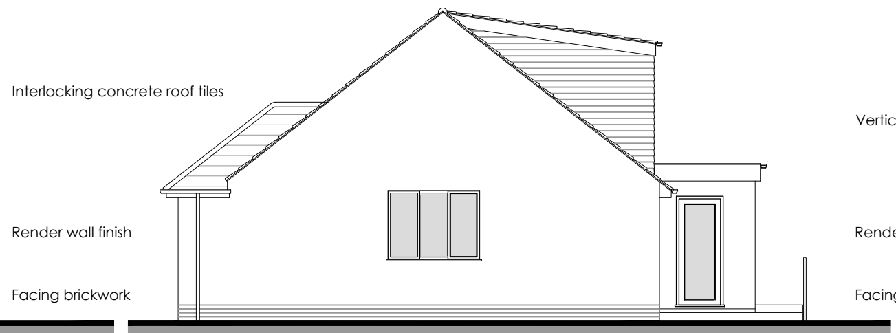
Proposed (Side) North East Elevation