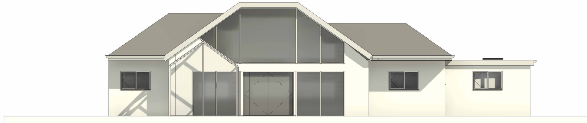
1 PROPOSED EAST 1 : 100