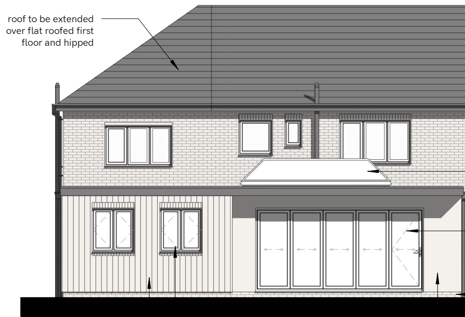
Rear 1 : 100

New rear windows to UPVC as existing, colour to be confirmed, with brick soldier course heads and 75mm brick cills vertical timber panelling finish to extruded section of rear extension off-white render finish to inset section of rear extension