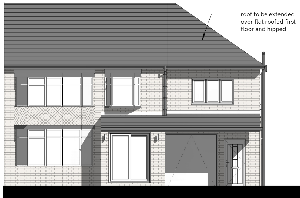
Front 1 : 100

NOTE: Do not scale from this drawing. This drawing is copyright of Ergo Projects Ltd. All dimensions to be checked prior to any work commencing. Any discrepancies to be reported to Ergo Projects immediately.