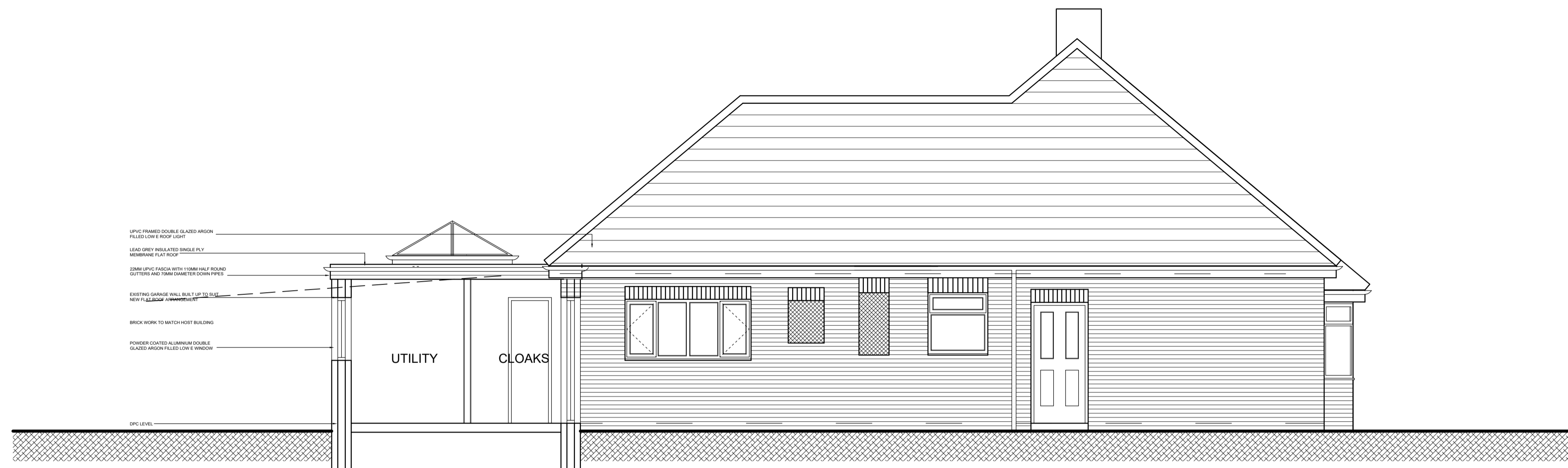
PROPOSED NORTH WEST (BOUNDARY) ELEVATION