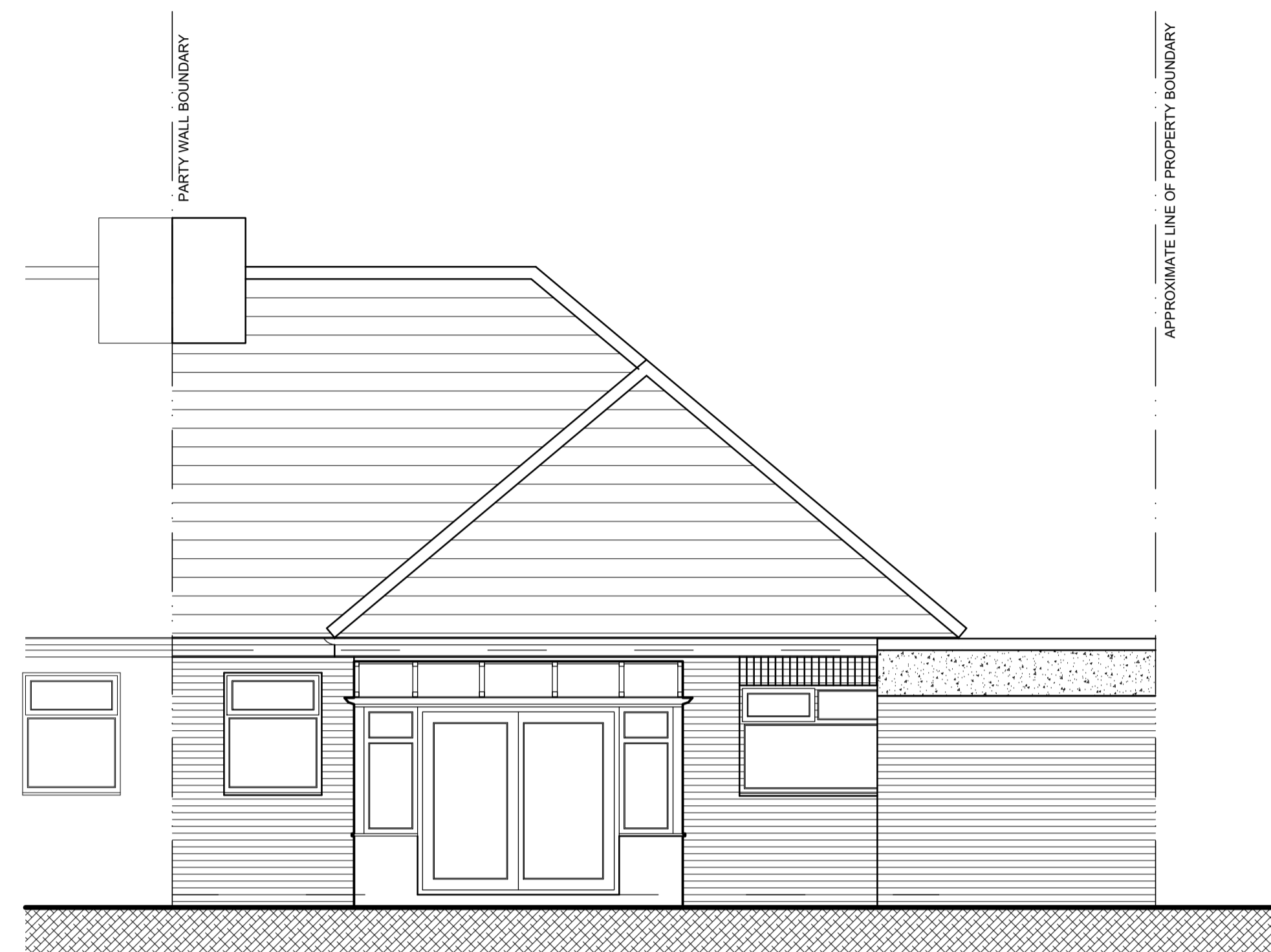
EXISTING NORTH EAST (REAR) ELEVATION