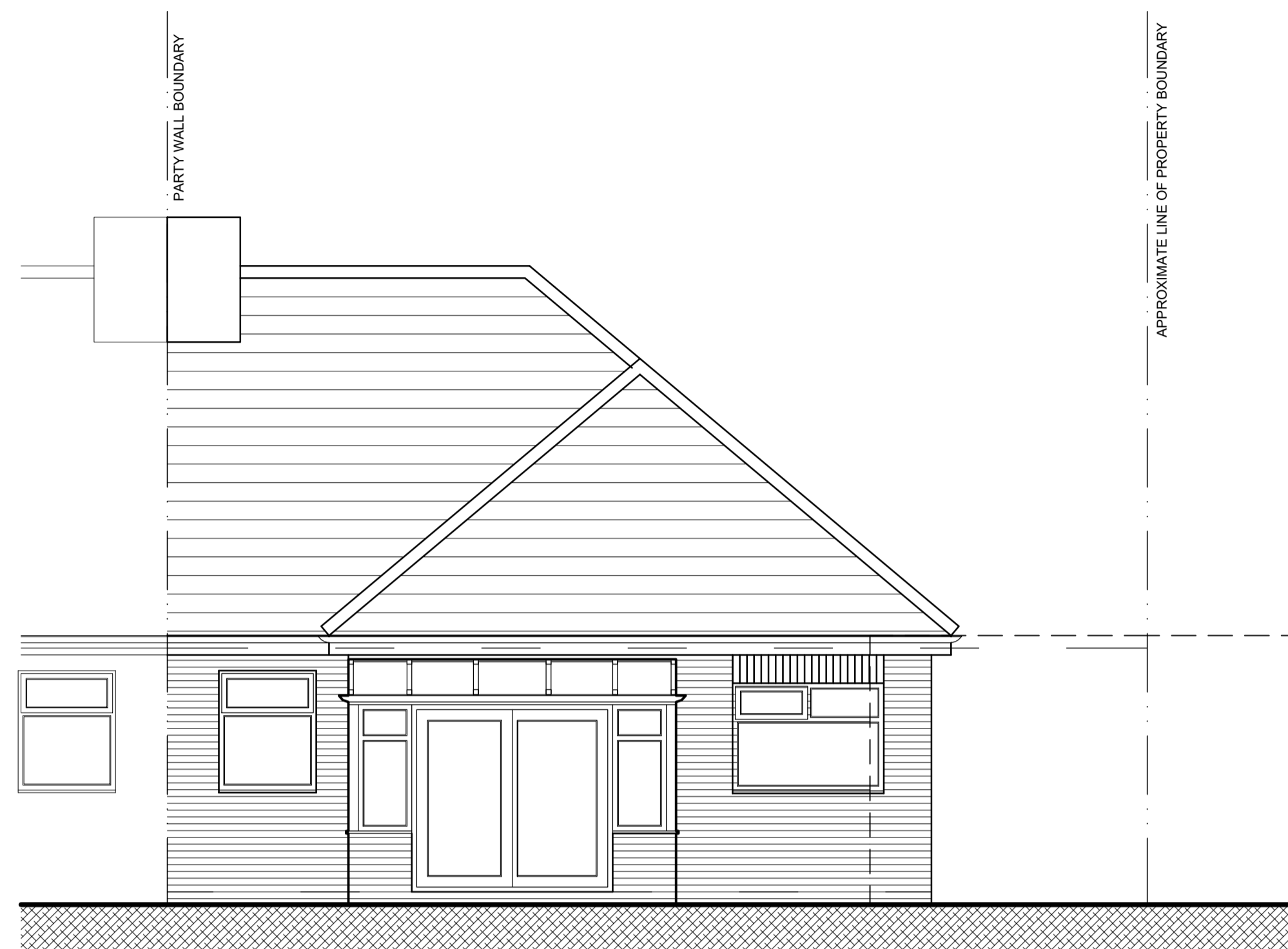
EXISTING NORTH EAST (REAR) ELEVATION

All dimensions to be checked on site. Do not scale from this drawing, work to figured dimensions only. Any omissions or discrepancies shall be reported to the Architect.