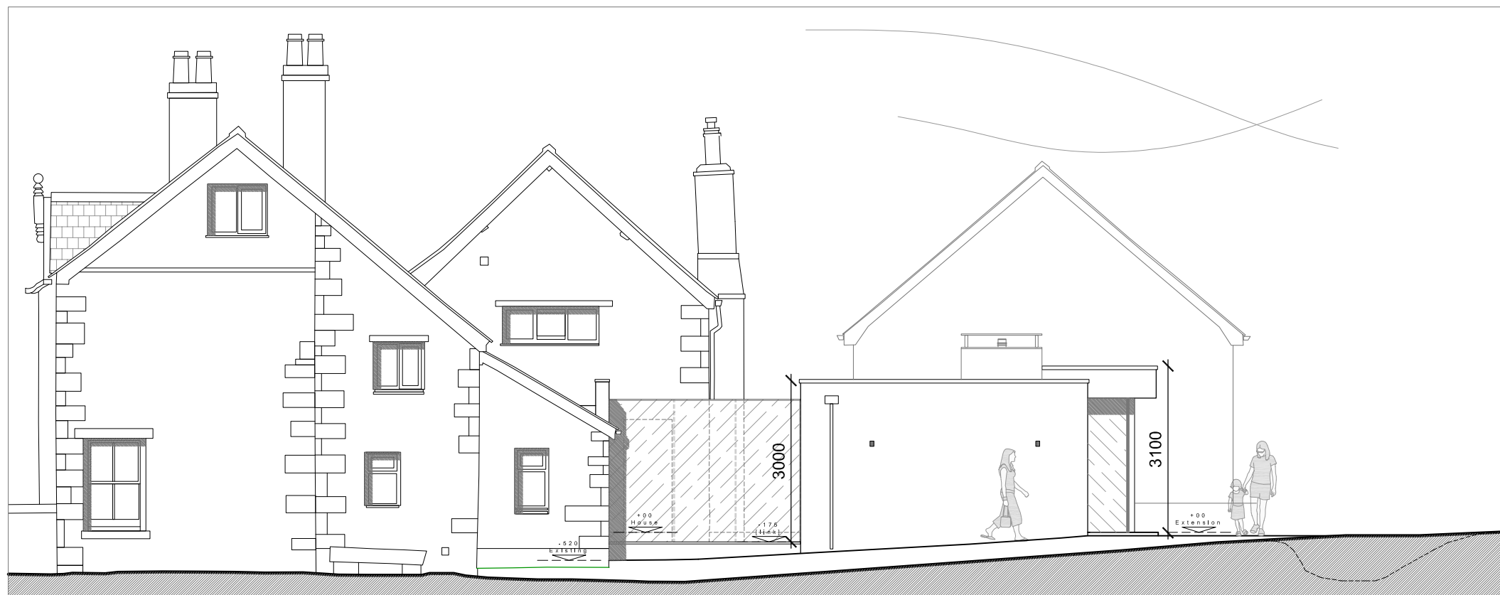
02 - Elevation to side / North