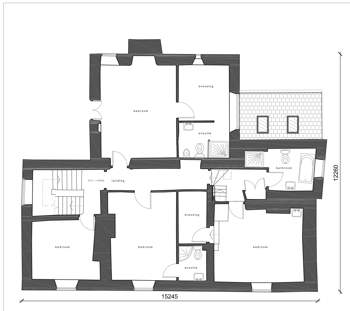
- First Floor Layout Plan