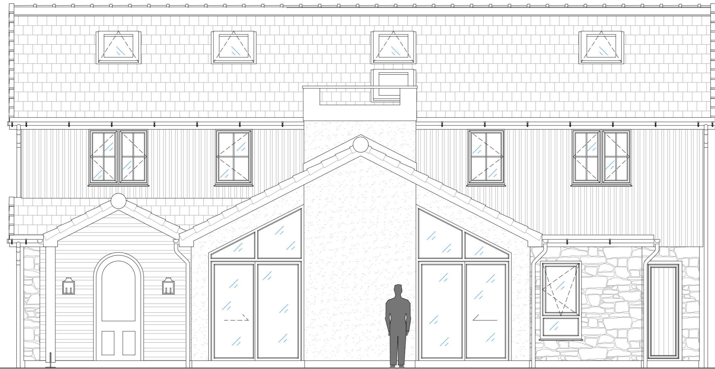
A PROPOSED ELEVATION SCALE 1:50@A2