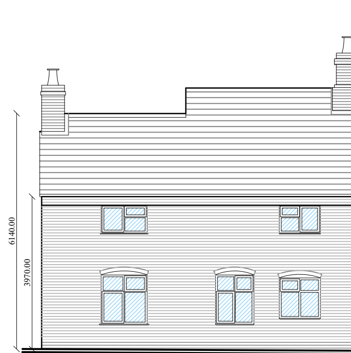
Front Elevation (facing East) scale 1:50