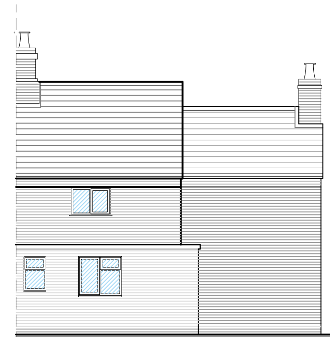
Rear Elevation (facing West) scale 1:50

ground floor internal floor area = 46.8 sqm first floor internal floor area = 34.8 sqm overall gross internal floor area = 81.6 sqm