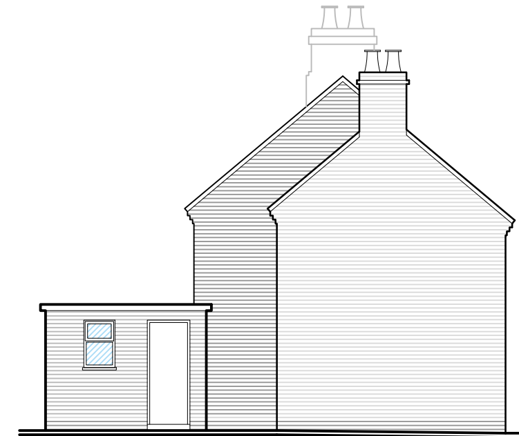
Side Elevation (facing South) scale 1:50