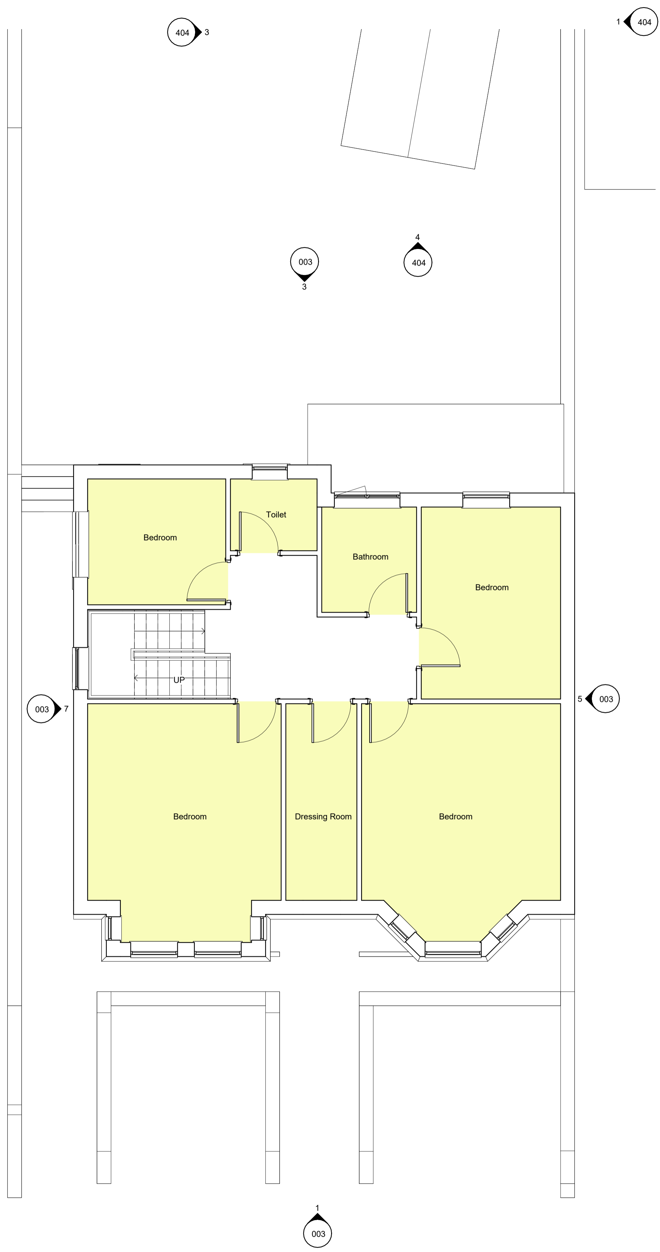
1 First Floor Plan - Existing SCALE: 1 : 50