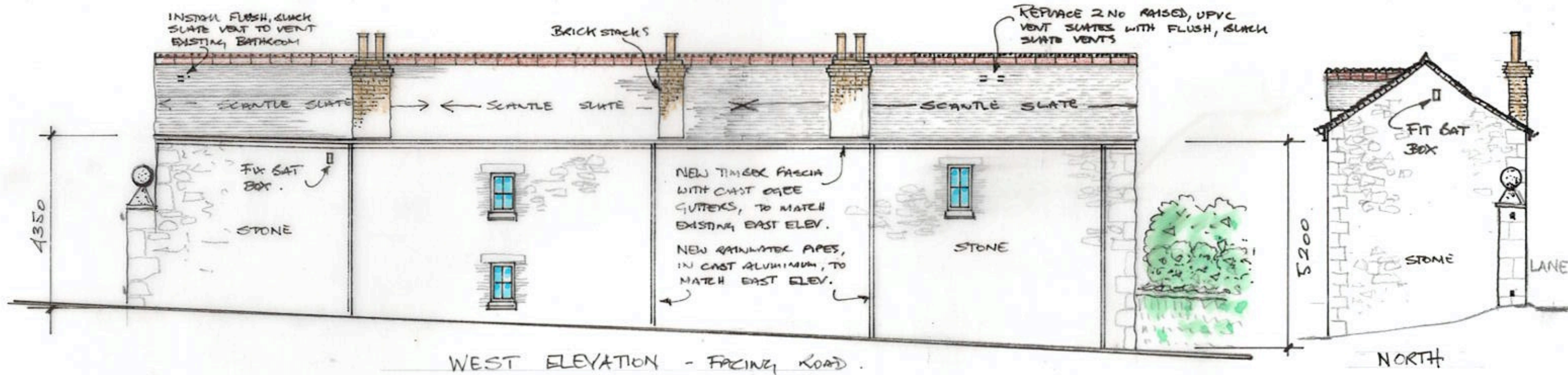
WEST ELEVATION - FACING ROAD.