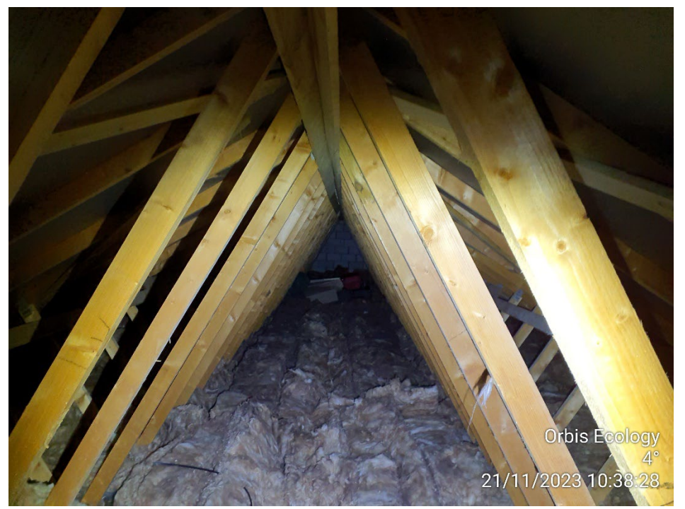
Interior of roof void