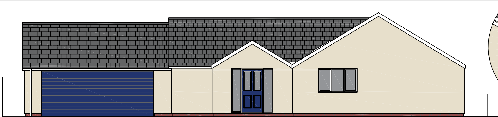
PROPOSED NORTH-WEST ELEVATION 1:100