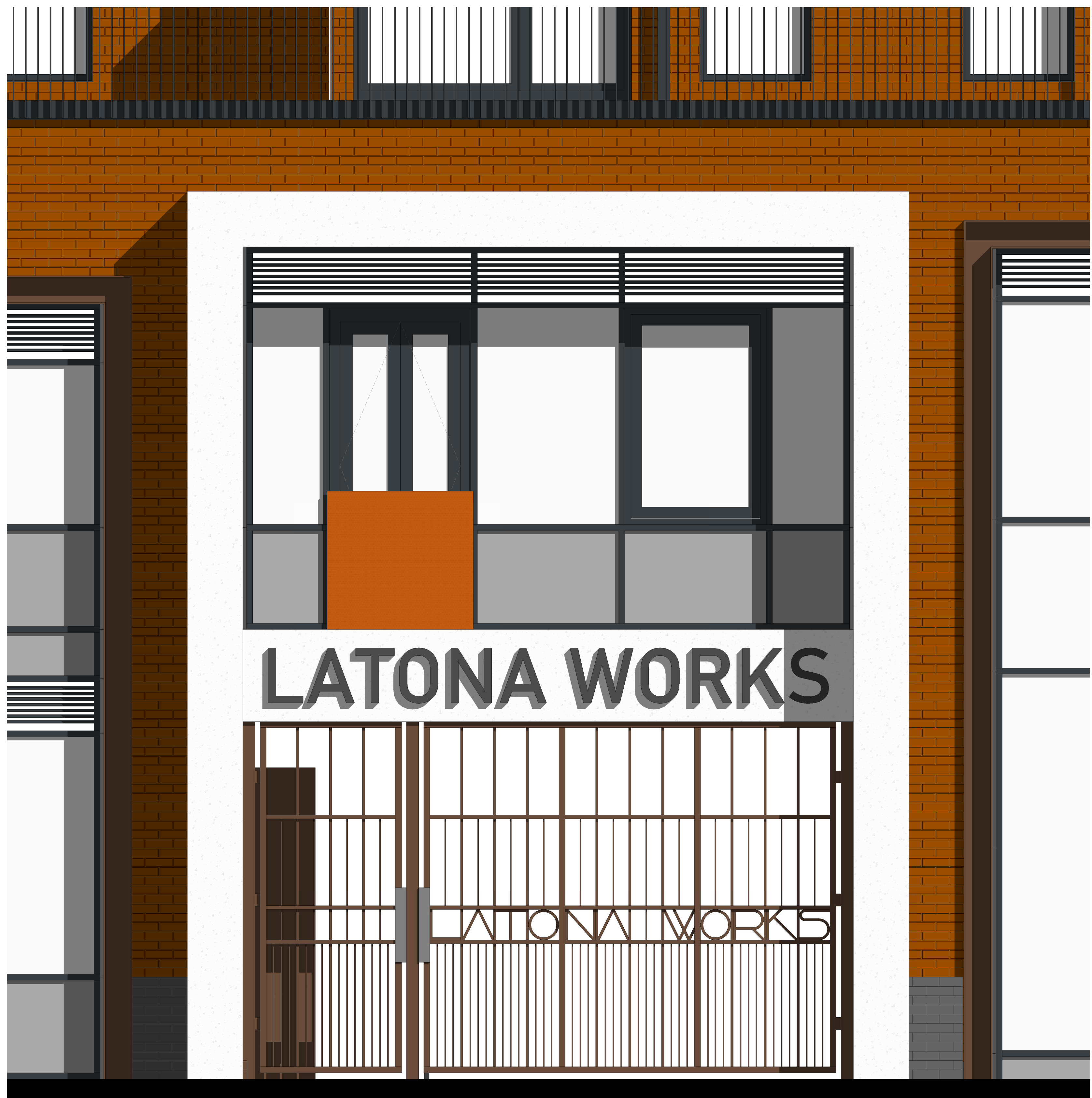
3. Elevation 1:20