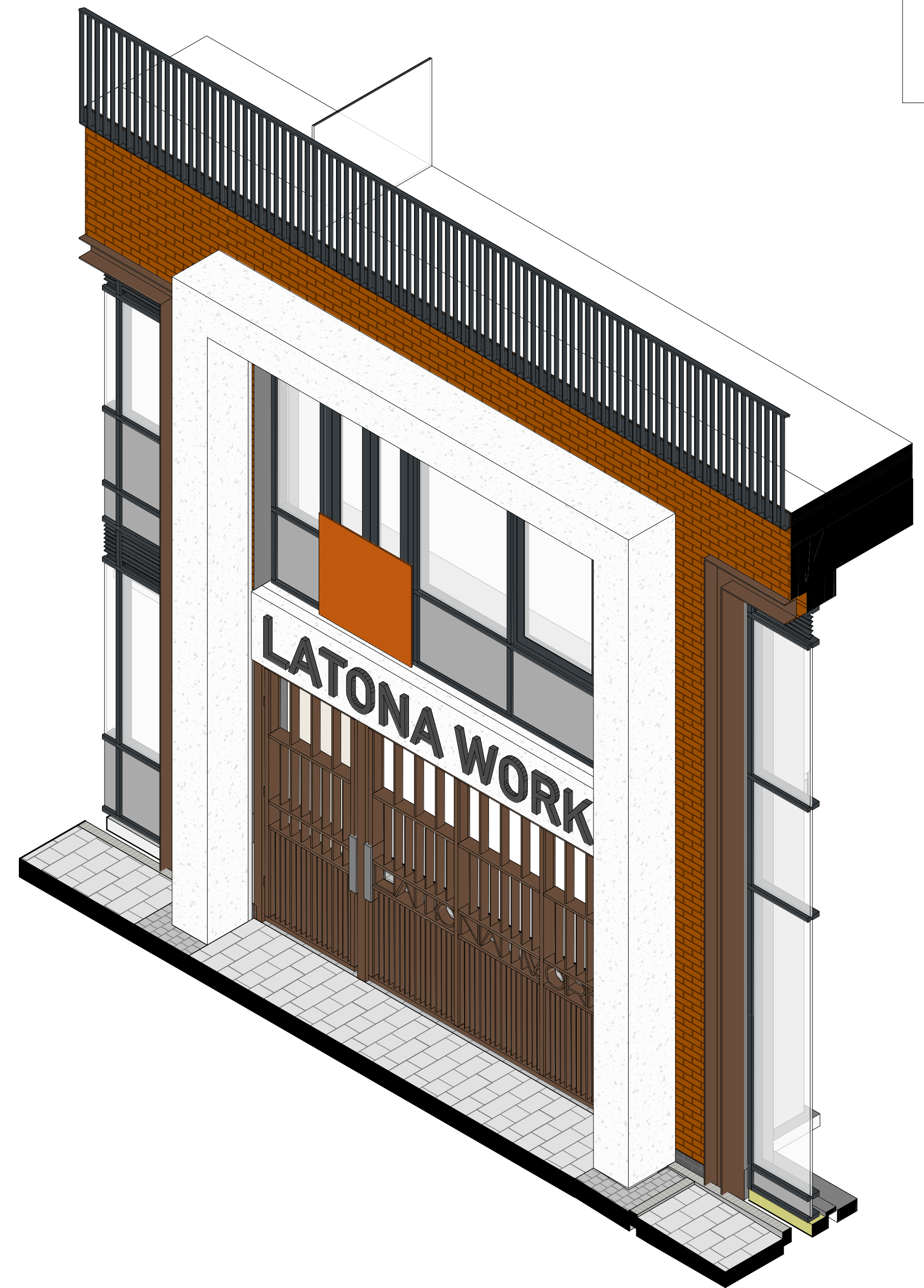
2. 3D View