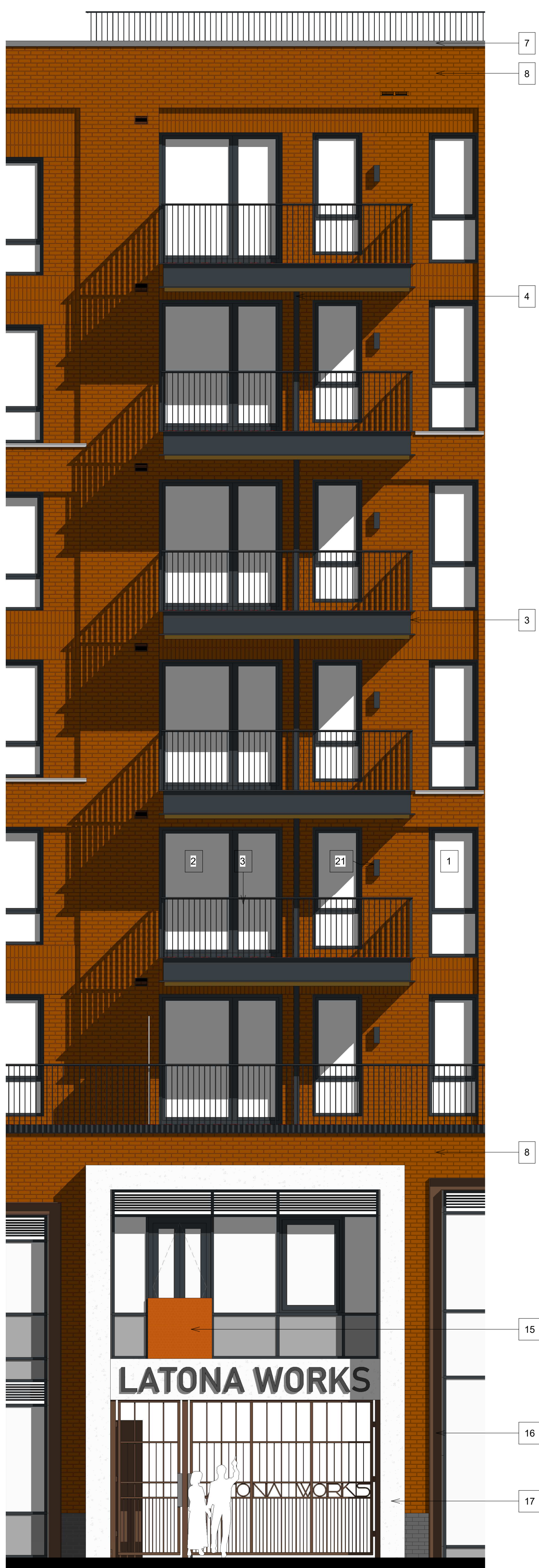
4. Elevation 1:50