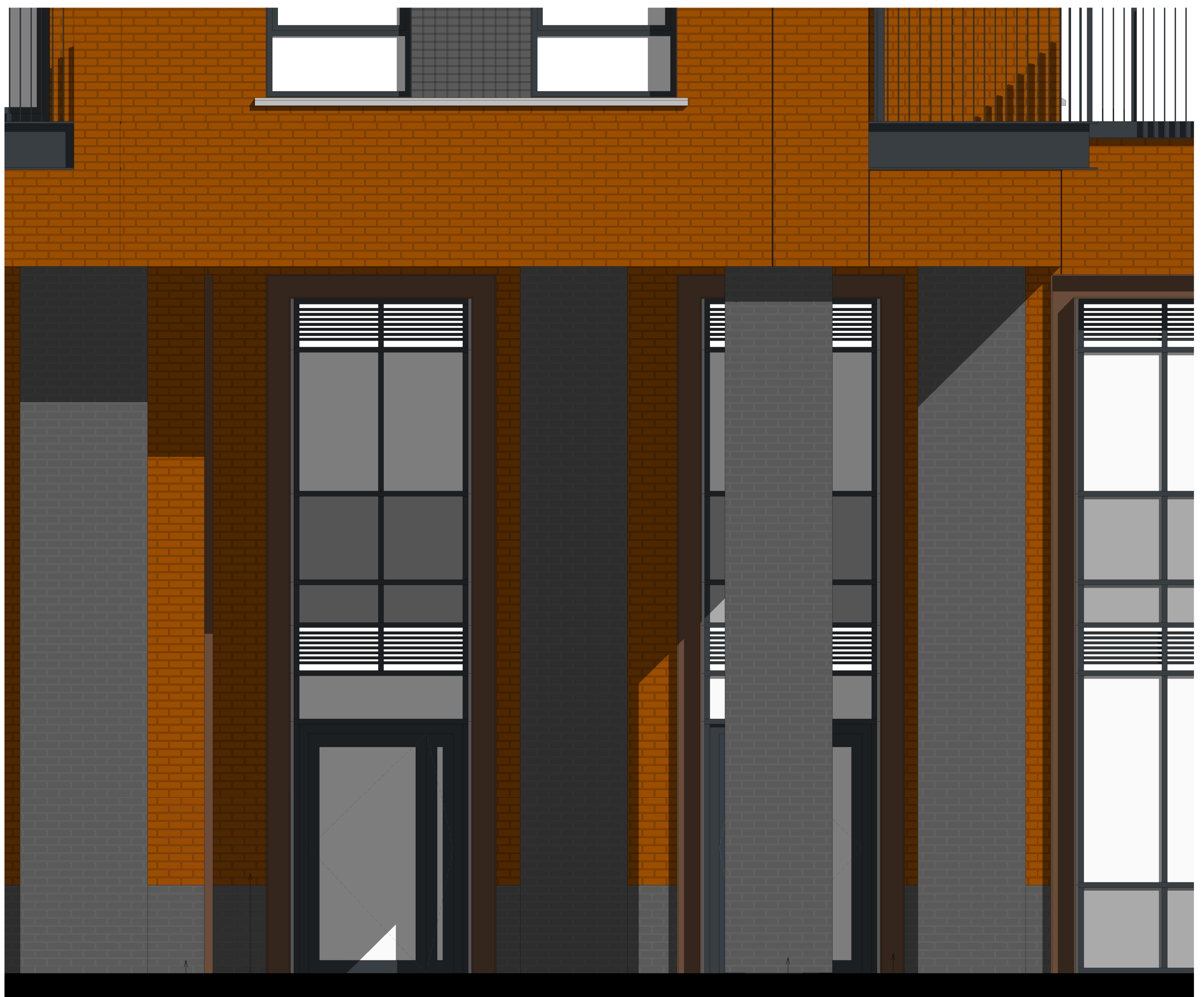
3. Elevation 1:20