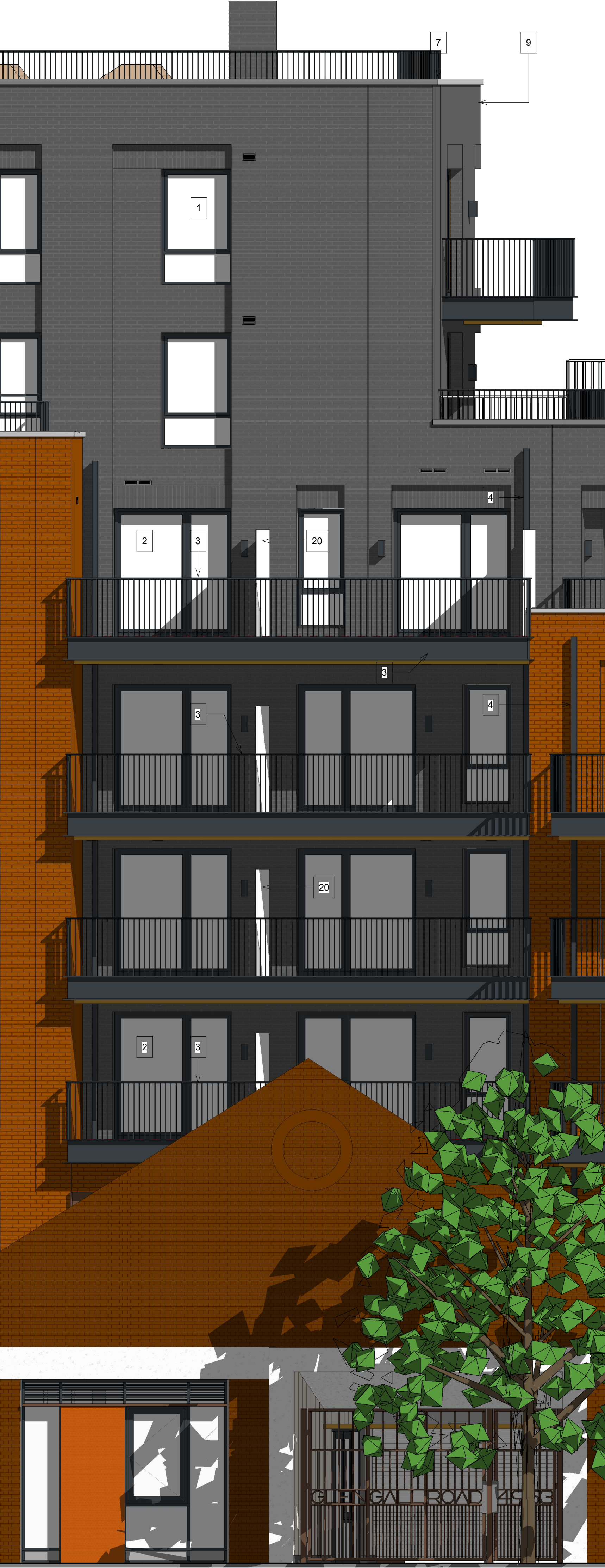
3. Elevation 1:20