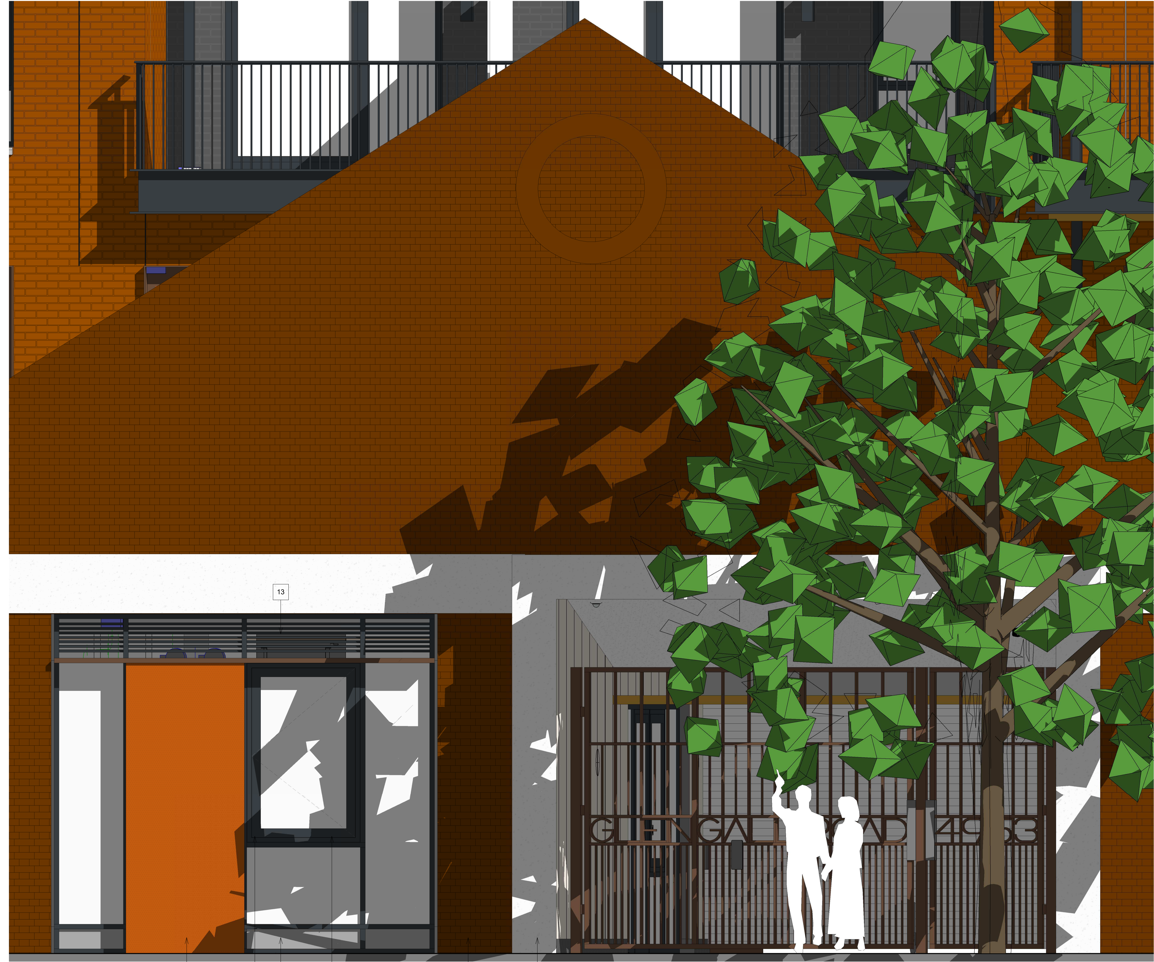
2. Elevation 1:20