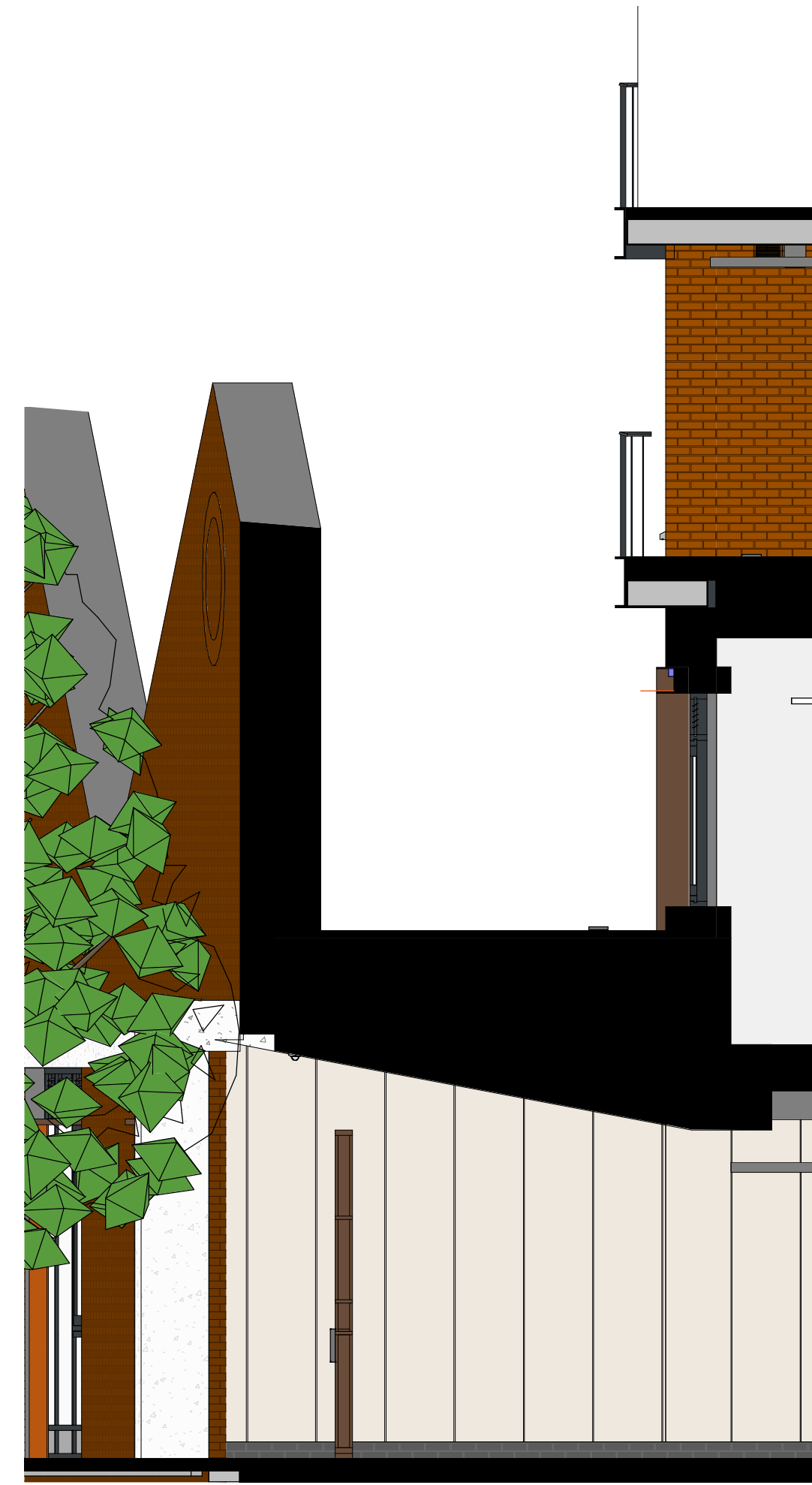
1. Section 1:50