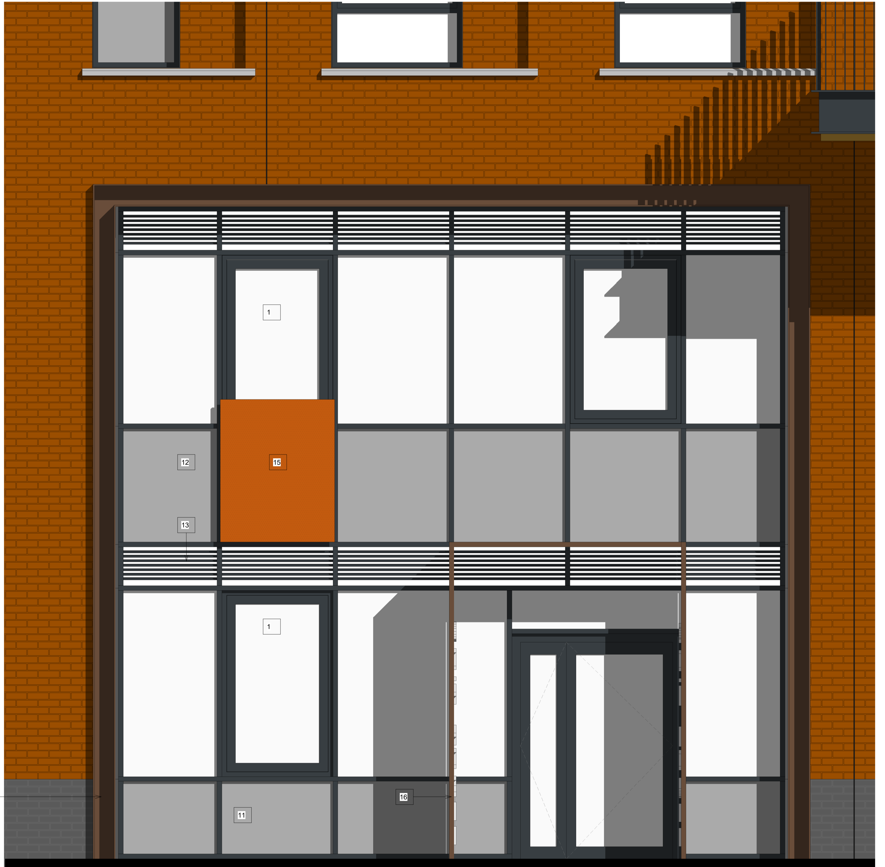
3. Elevation 1:20