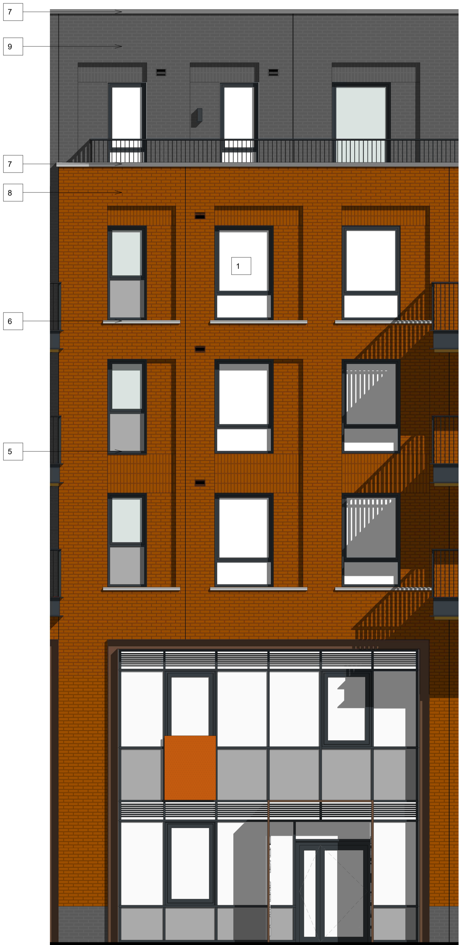
4. Elevation 1:50