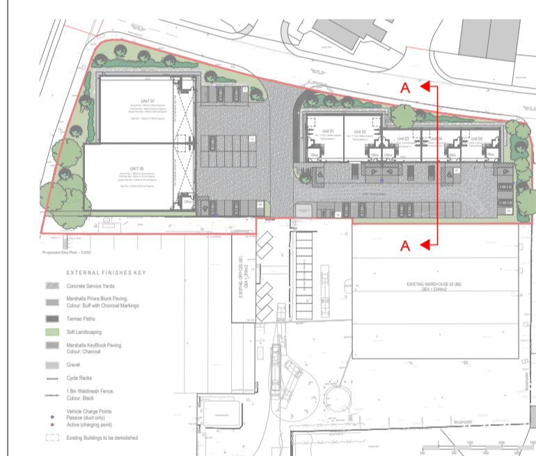
SECTION AA KEY PLAN NTS

P01 preliminary issue for comment 17.08.23 revision note date