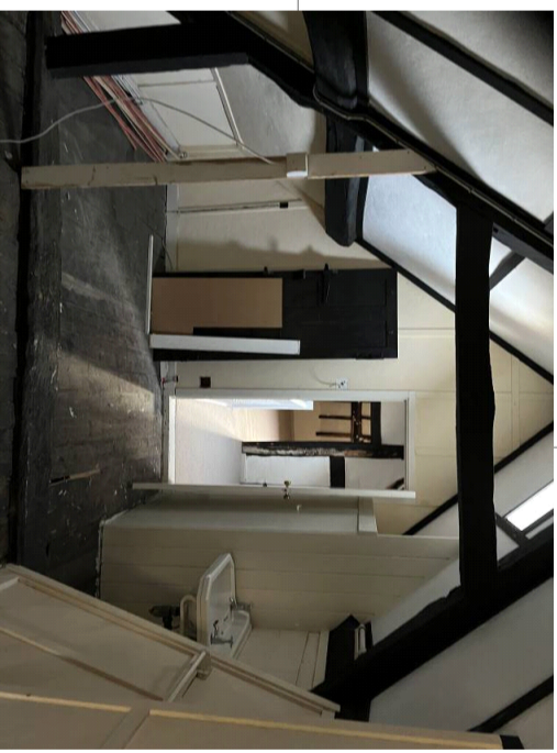
Image above shows a view looking west into the space to be reinstated as a shower room. Note the wash-hand basin remains in-situ.

The proposal is for the reinstatement of bathing facilities to the attic/second floor accommodation. It is proposed for a shower room/WC to be provided to serve the attic/second floor accommodation. The location for the new shower room/WC was previously used as a bathroom, that was provided within the 1930s refurbishment of the building.