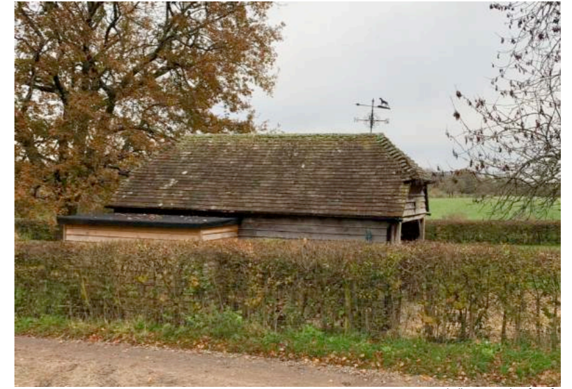
similar example of roof form showing barn hip at North Barn