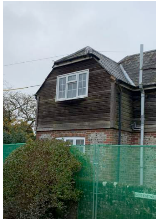
similar example of roof form showing barn hip at Kent cottage