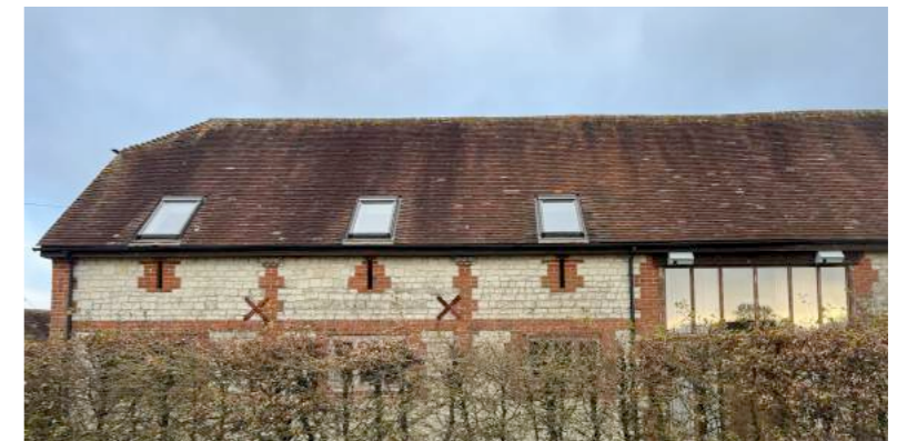
similar example of roof form showing barn hip at Kent Barn