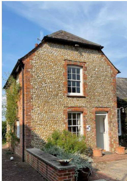
similar example of roof form showing barn hip at Cole cottage