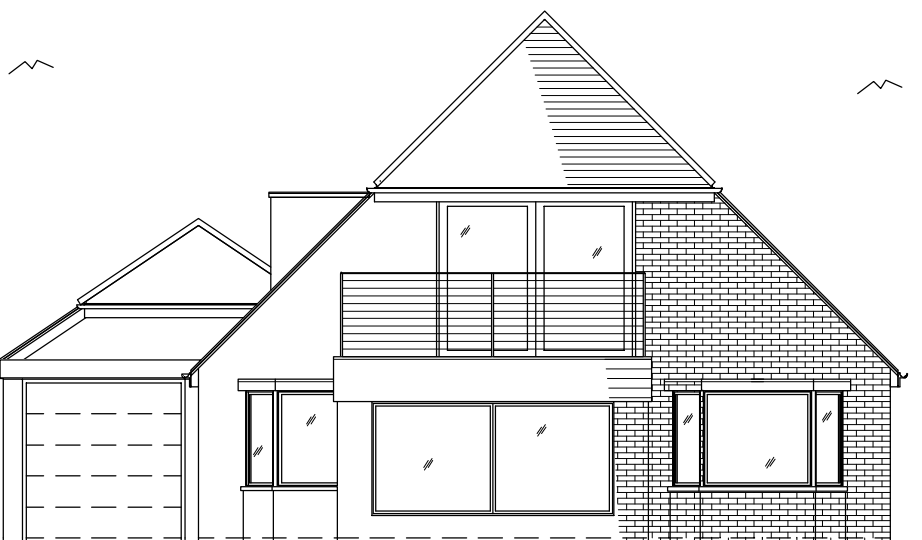
EXISTING FRONT ELEVATION (SOUTH WEST) (SCALE 1:100 @ A3)