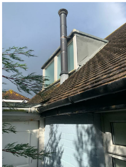
Site Photo 23035-IMG-04