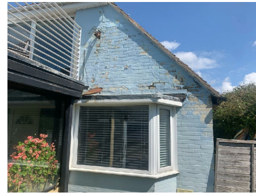
Site Photo 23035-IMG-05