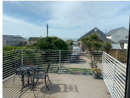
Site Photo 23035-IMG-07