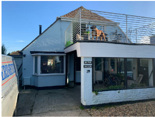
Site Photo 23035-IMG-02