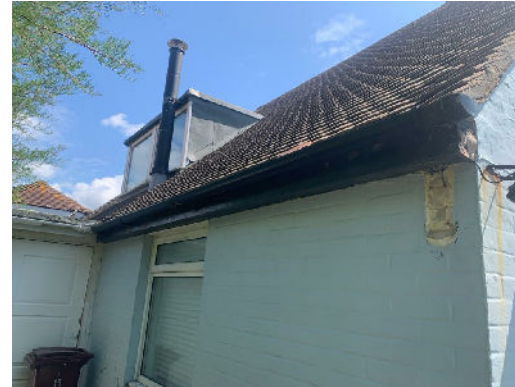
Site Photo 23035-IMG-06