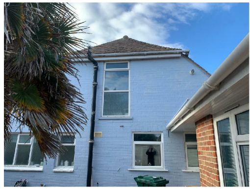
Site Photo 23035-IMG-03