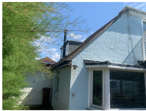
Site Photo 23035-IMG-01