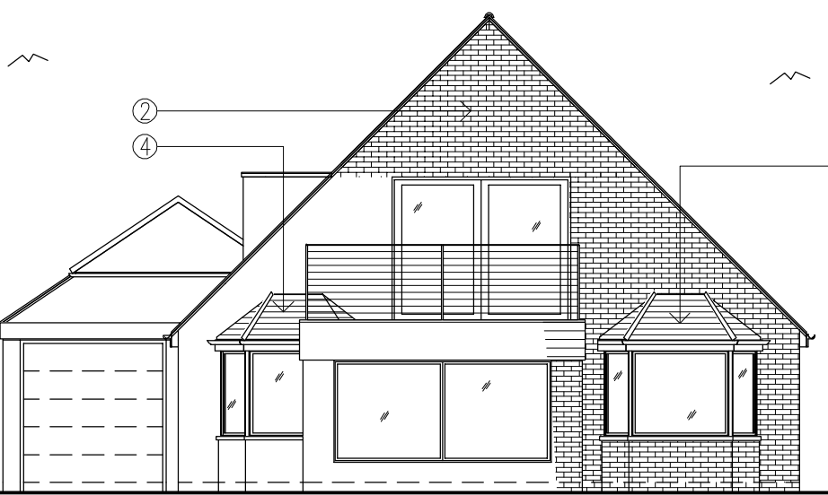
EXISTING FRONT ELEVATION (SOUTH WEST) (SCALE 1:100 @ A3)