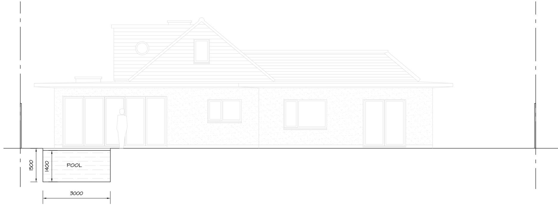
Proposed Cross Section Plan of Pool (North)

NOTES: This drawing has been produced solely for PLANNING/DESIGN. Do not Scale from this Drawing except for planning purposes. Any drainage shown is presumed and to be checked on site before commencement of works. This drawing is the copyright of MF Designs Ltd.