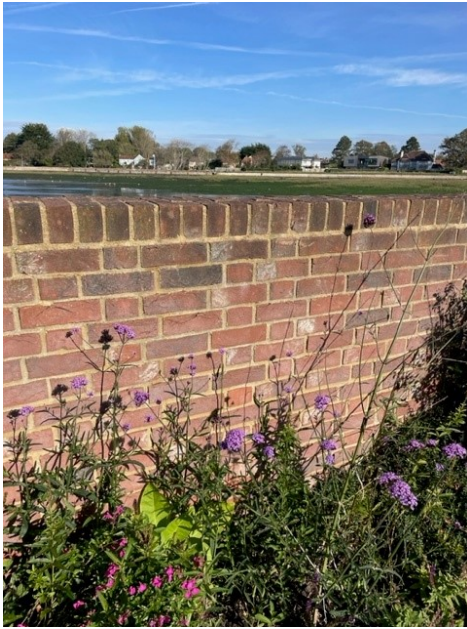
Image 1. View of the wall from the garden side.