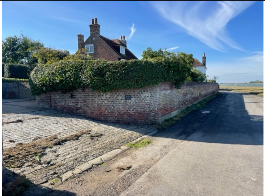
Image 2. Long view of the wall from the west.