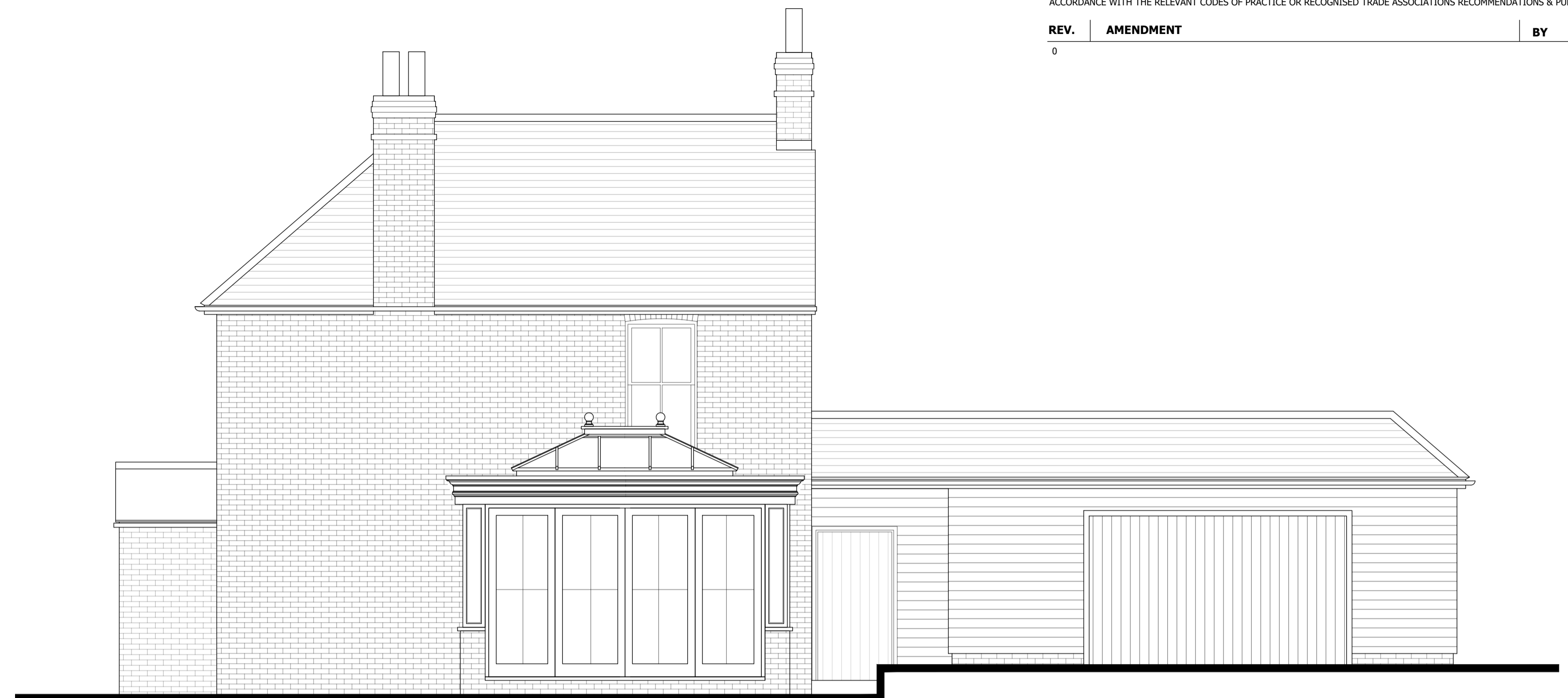
North Elevation Proposed