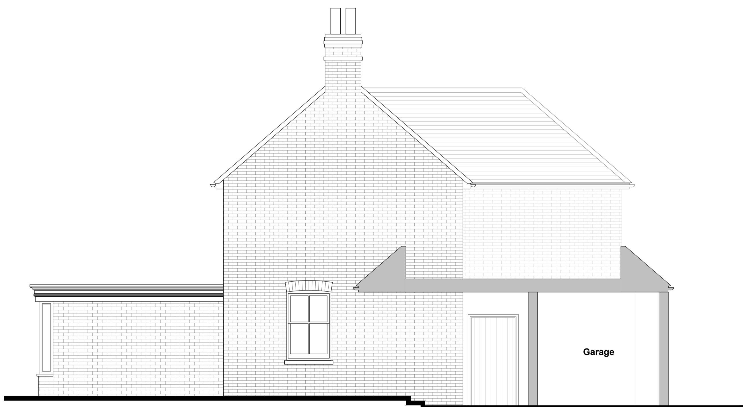
West Elevation Proposed