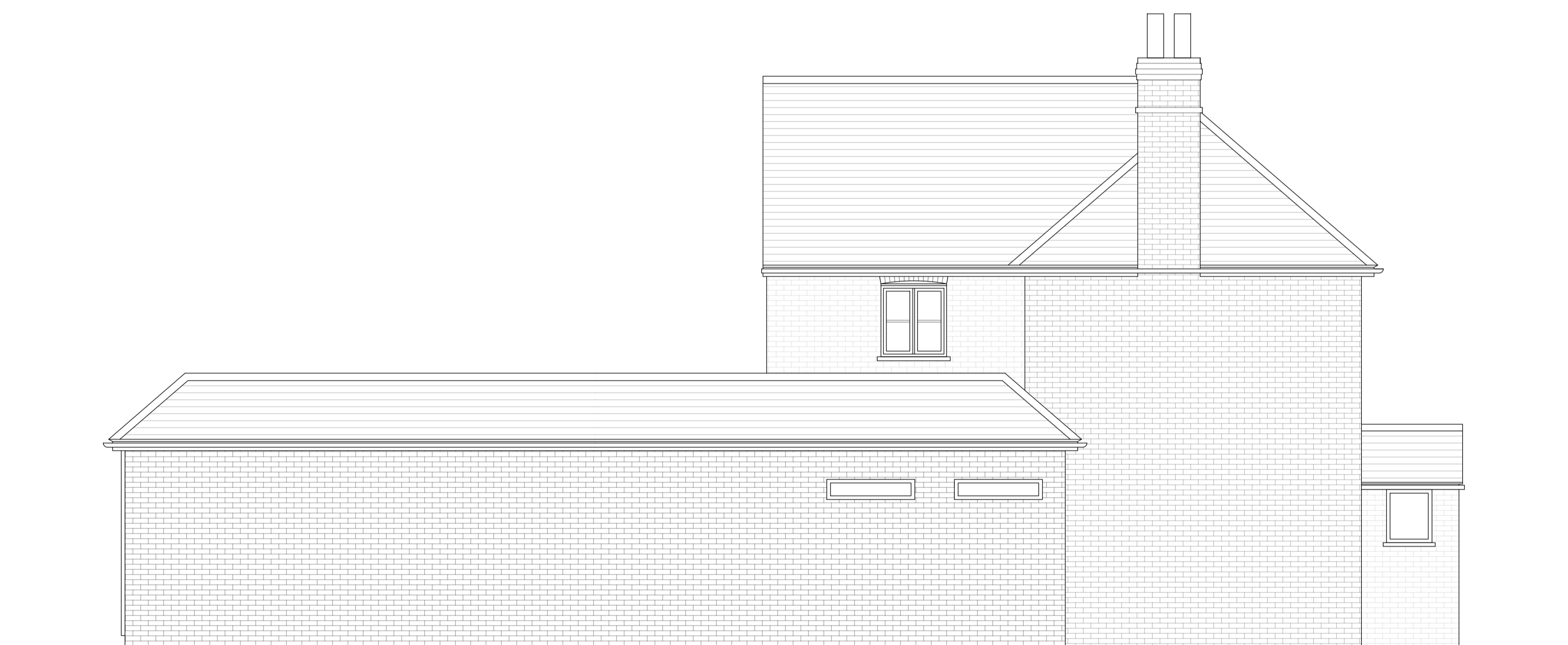
South Elevation Proposed