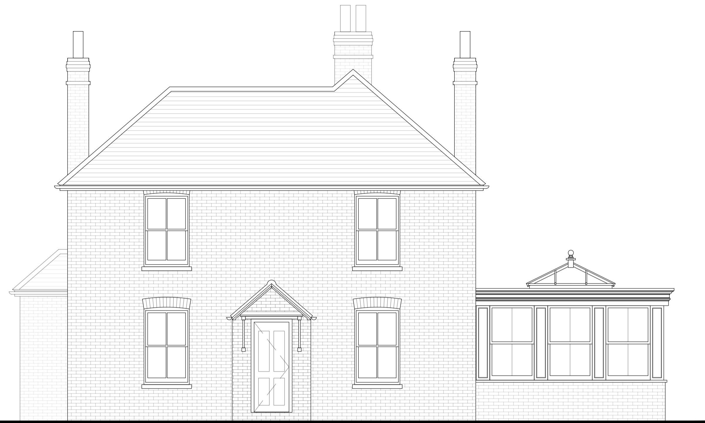
East Elevation Proposed