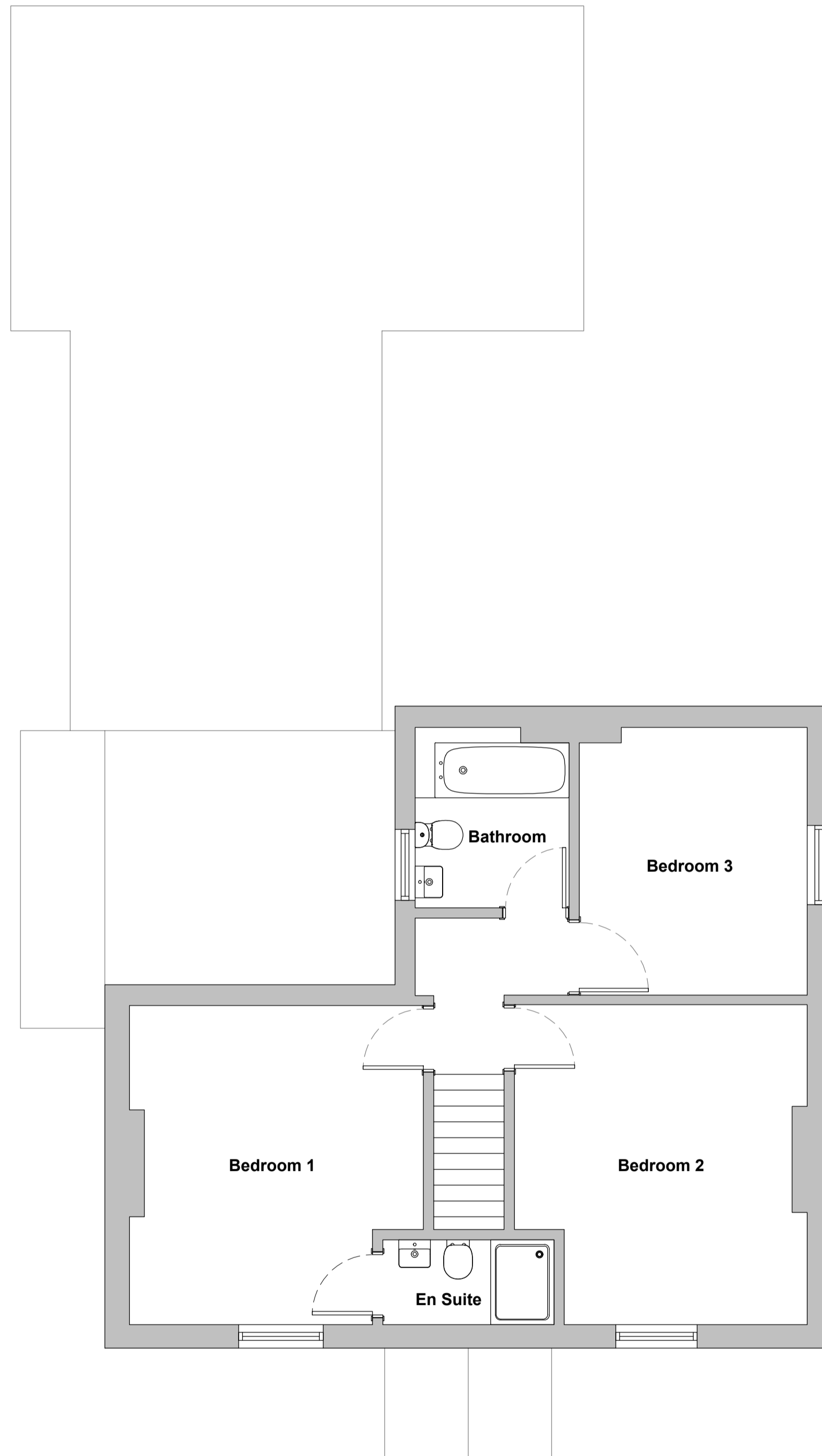
First Floor Existing