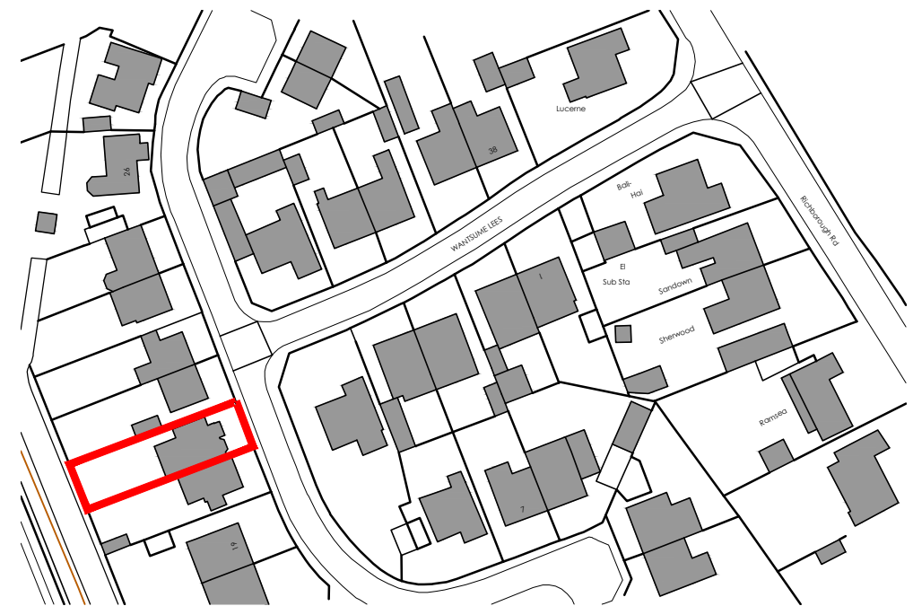
Site Location Plan Scale 1:1250