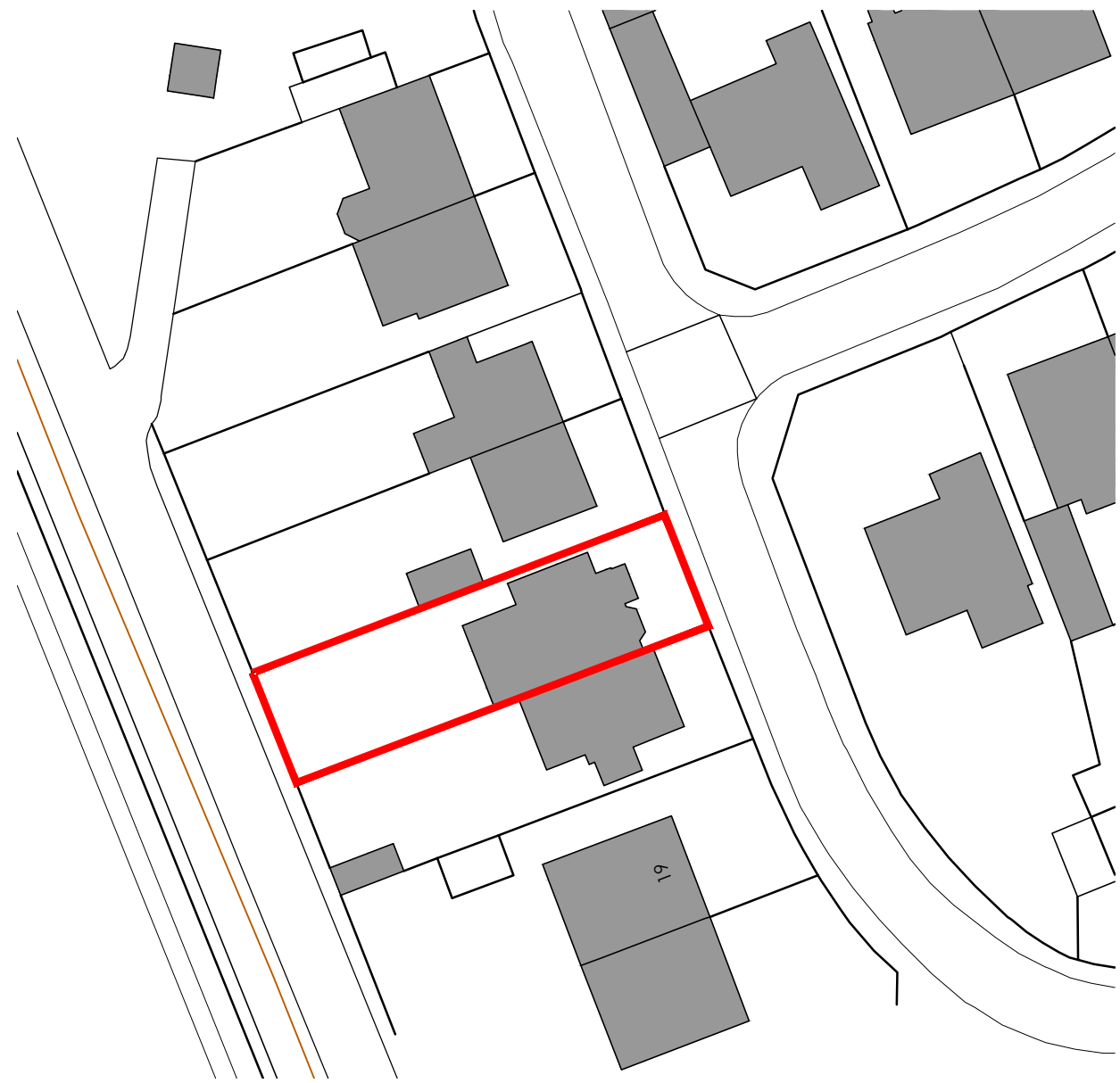
Existing Site Location Plan Scale 1:500