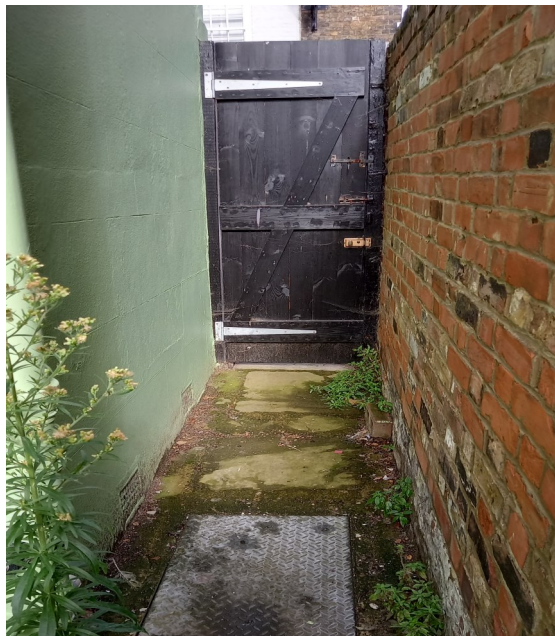
Side gate to Garden accessed via Middle Street