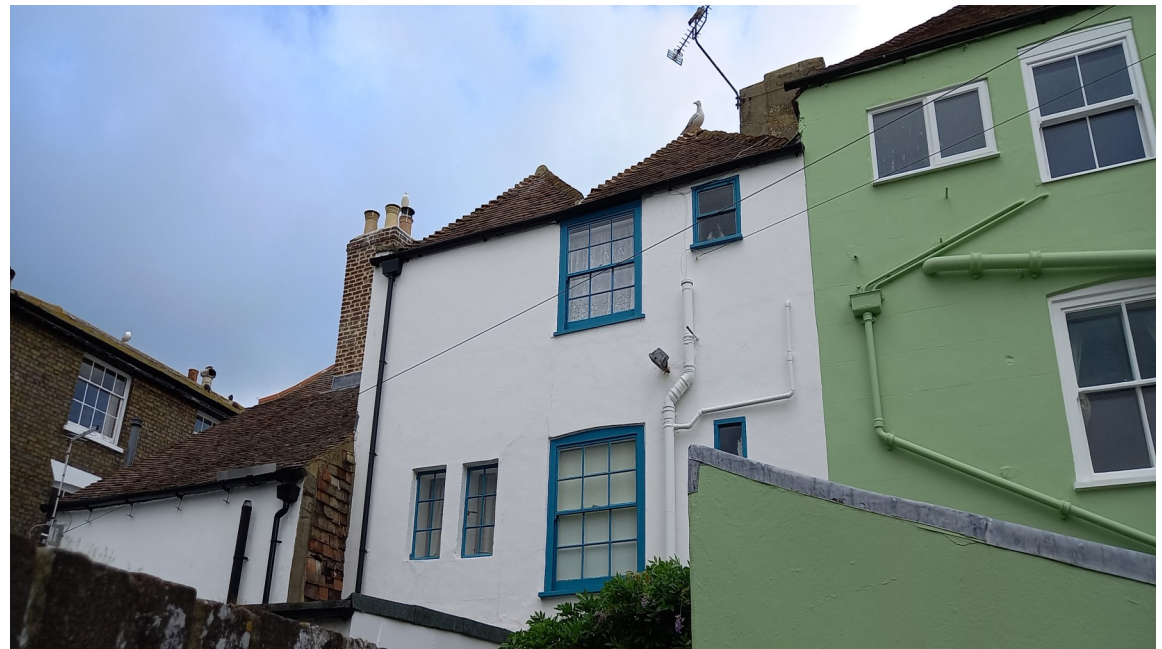
View of the rears of Nos. 117 & 115