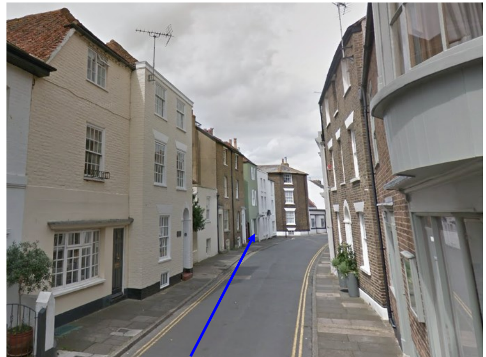
View from Coppin Street (West)