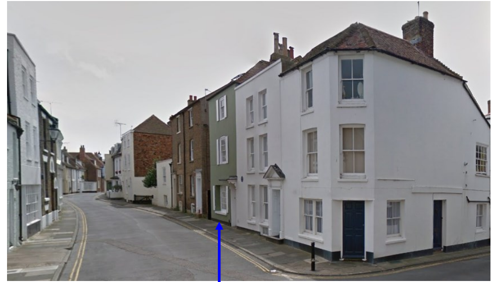
View from Farrier Street

To the rear the property is typically more utilitarian in appearance with 2 over 2 flush sashes and a modern casement to the upper floor with a single storey rear extension, also rendered, which is currently in the process of being replaced with a brick extension.