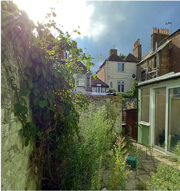
Rear boundary wall looking North