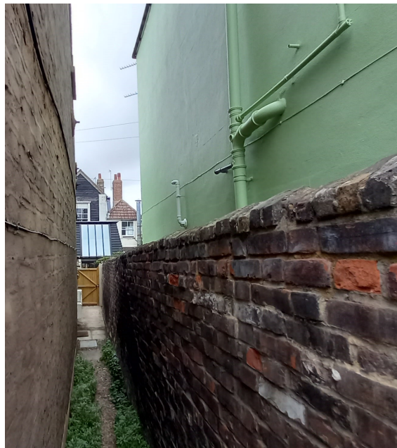
Access alleyway between Nos. 113 & 115