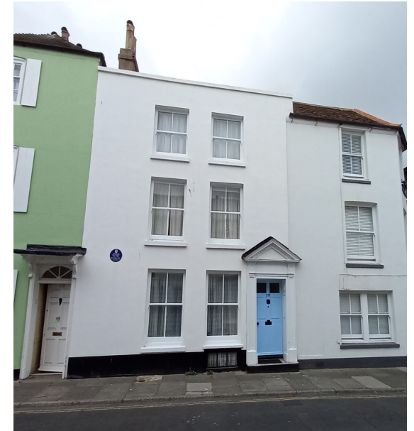
View of Nos. 115 & 117 from Middle Street