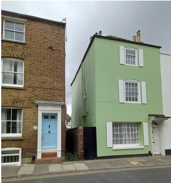
View of Nos. 113 & 115 from Middle Street