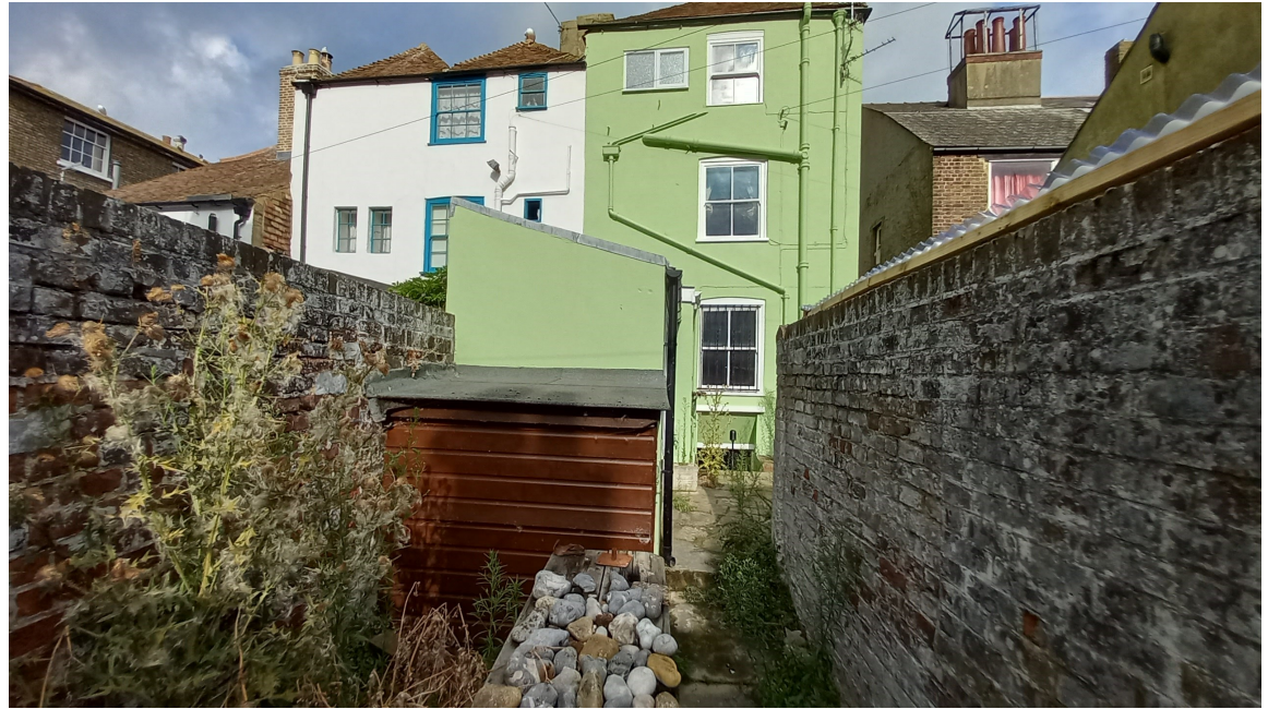
Western view of the property's rear