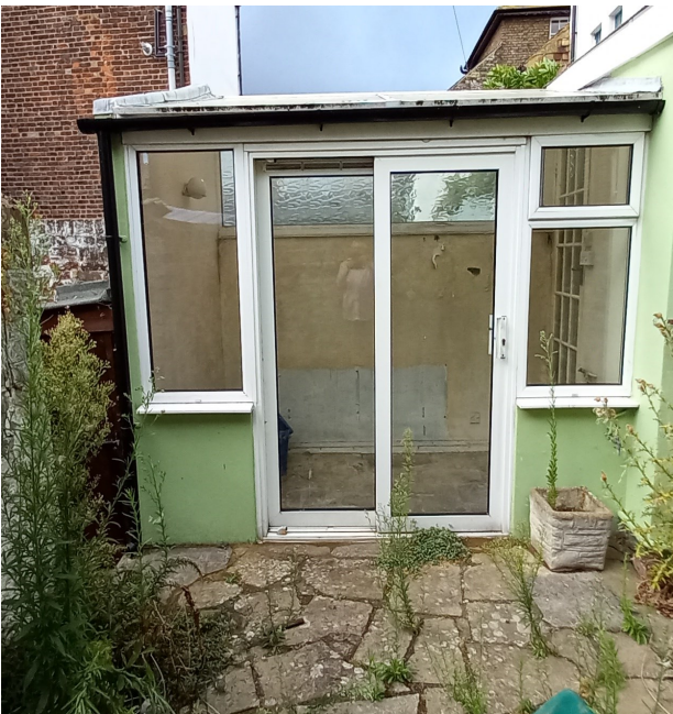
Eastern view from boundary wall furthest South