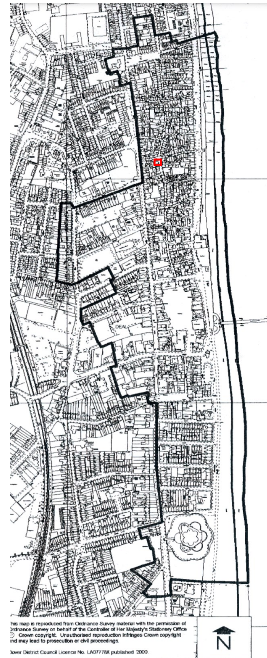
Middle Street Conservation Area

The Middle Street Conservation Area was originally designated in 1968 with its boundaries modified to encompass the area between Alfred Square to the north and the castle to the south. Its distinctive character is typified by the central axis of mainly Georgian terraced houses clustered around Middle Street, which change to grander Victorian villas closer to Deal Castle. Protection of the special character of the area has been enhanced by an Article 4(2) Direction which requires a planning application for painting frontages.