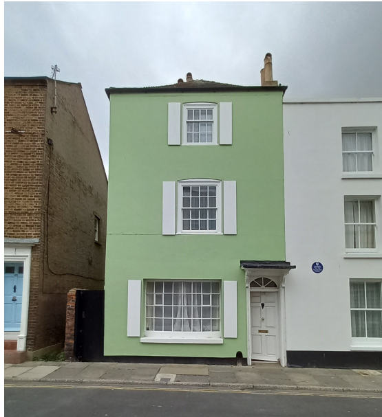
View of No. 115 from Middle Street