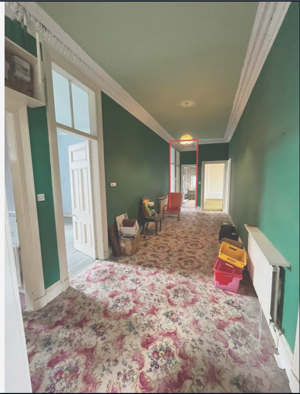
Door to be retained as new utility door.