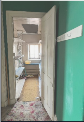
Photo left, showing existing store cupboard.

This minor change within the context of the overall hallway area will reserve its primary characteristics and proportions, while the addition of an en-suite and separate utility will substantially enhance the current amenity.