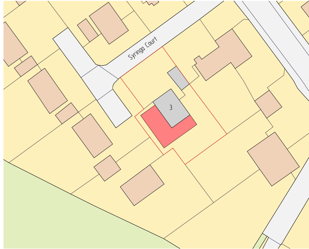
BLOCK PLAN AS PROPOSED (SCALE 1:500@A3)