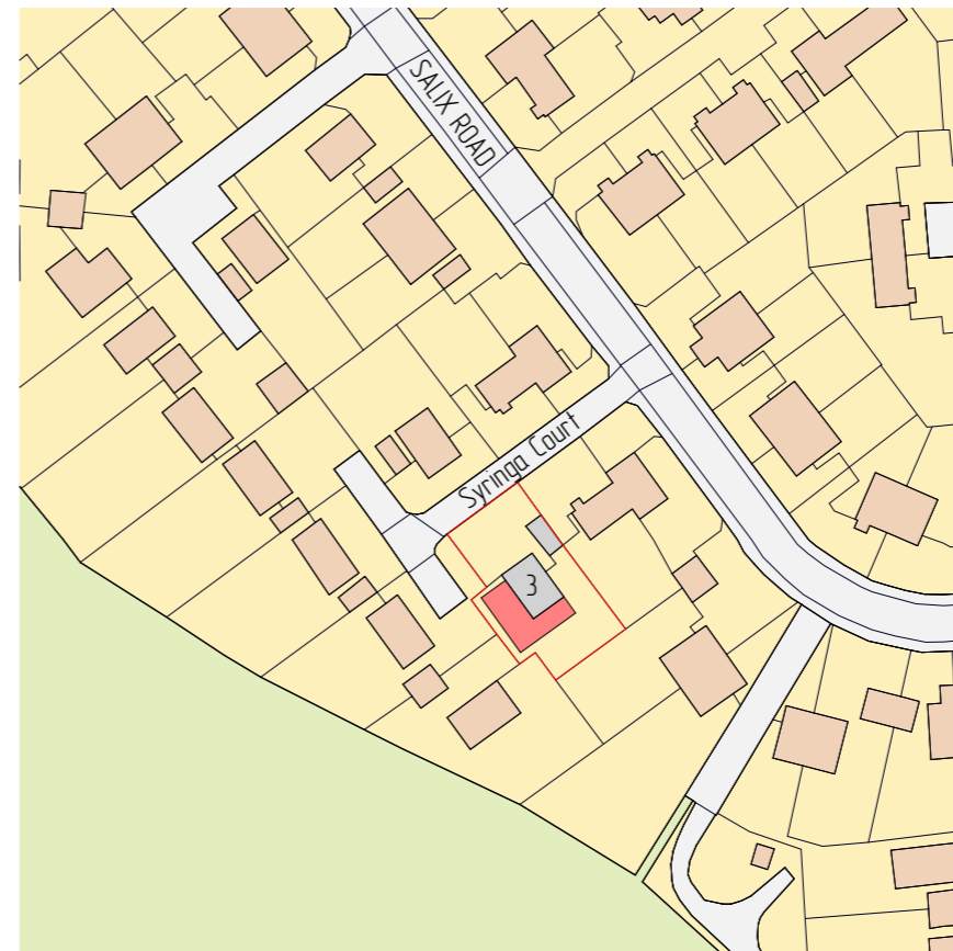
SITE LOCATION PLAN AS PROPOSED (SCALE 1:1250@A3)

THIS DRAWING IS THE PROPERTY OF AR. DESIGN AND MUST NOT BE COPIED OR REPRODUCED EXCEPT WITH THEIR EXPRESS PERMISSION, NOR MAY THE DESIGN OR ANY INFORMATION SHOWN THEREON BE DISCLOSED TO ANY THIRD PARTY. WE WILL NOT BE RESPONSIBLE FOR OTHER CONTRACTUAL DIMENSIONS. © THIS DRAWING IS COPYRIGHT