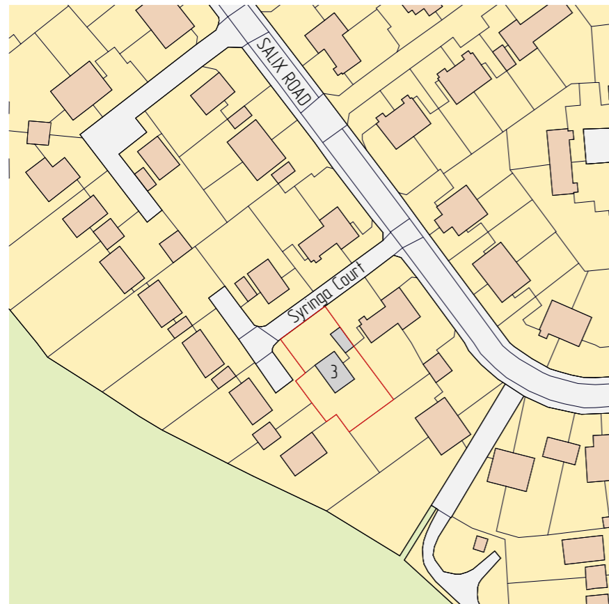
SITE LOCATION PLAN AS EXISTING (SCALE 1:1250@A3)