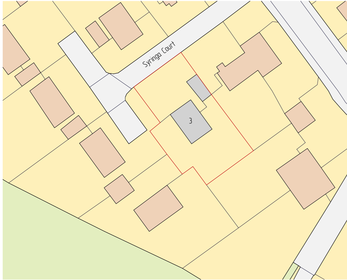
BLOCK PLAN AS EXISTING (SCALE 1:500@A3)