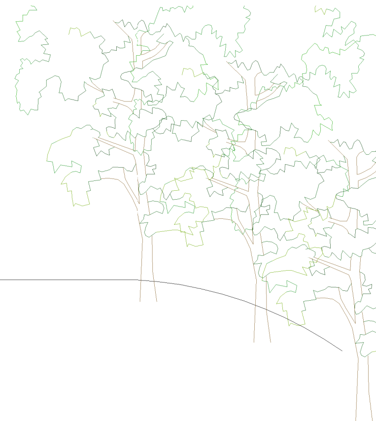
EXISTING REAR ELEVATION (NORTH) SCALE 1:100