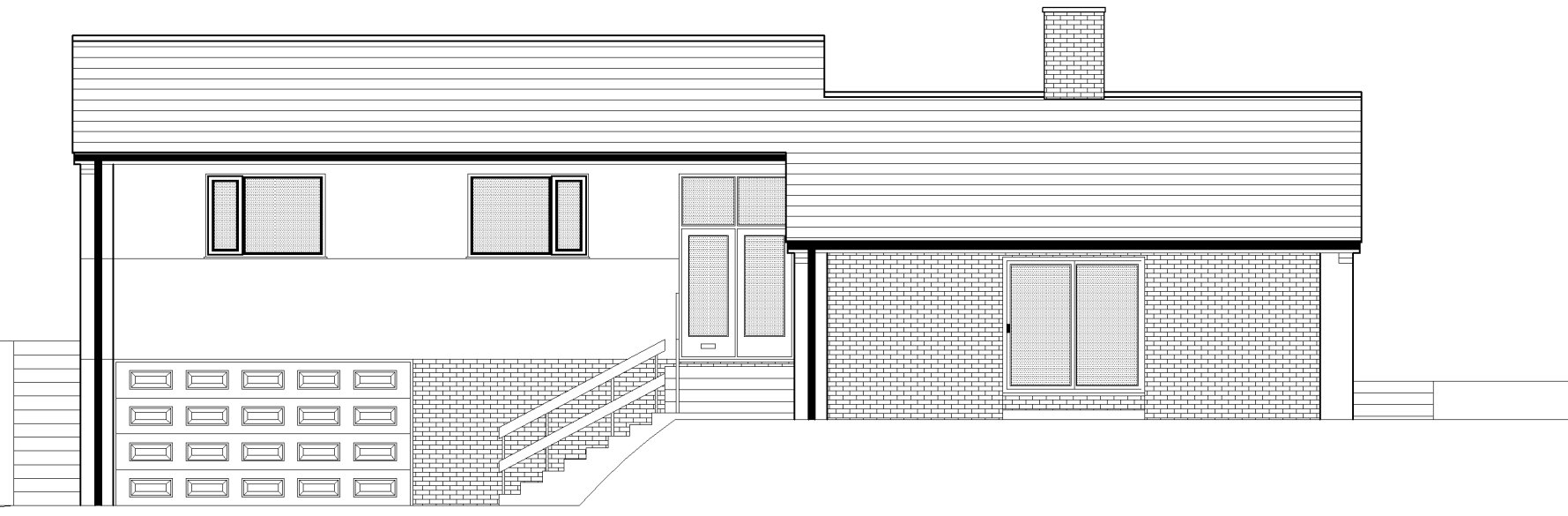
EXISTING FRONT ELEVATION (NORTH) SCALE 1:100