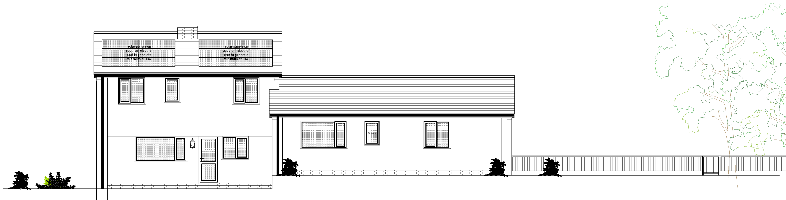
PROPOSED REAR ELEVATION (NORTH) SCALE 1:100