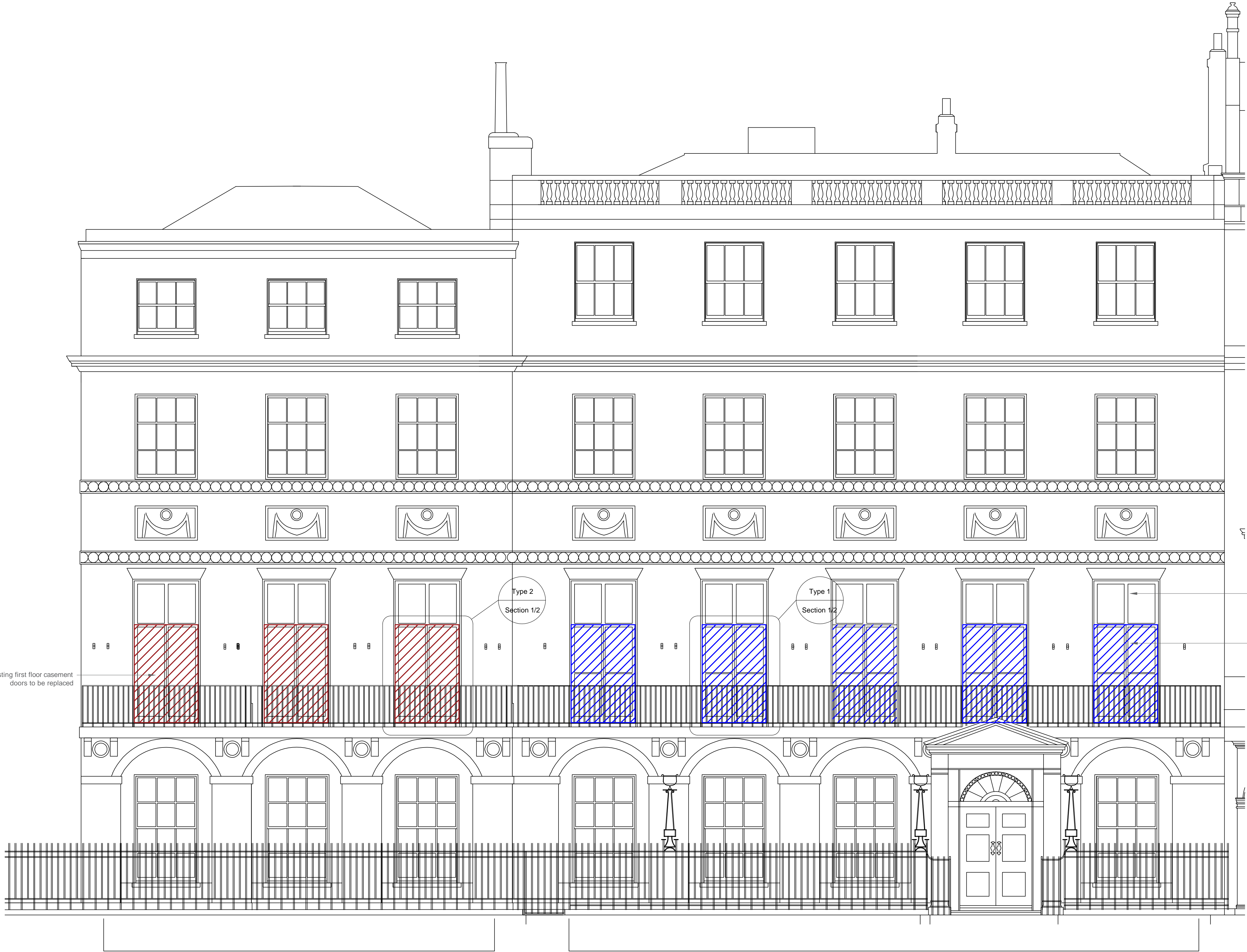
Gloucester Lounge and Vestibule Bar design -Type 2