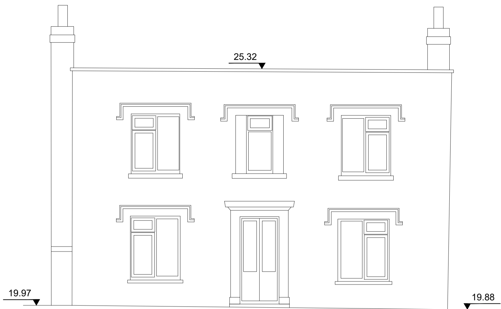
Datum 19.00m South Elevation

NOTES DRAWING REMAINS COPYRIGHT OF THE ARCHITECT.