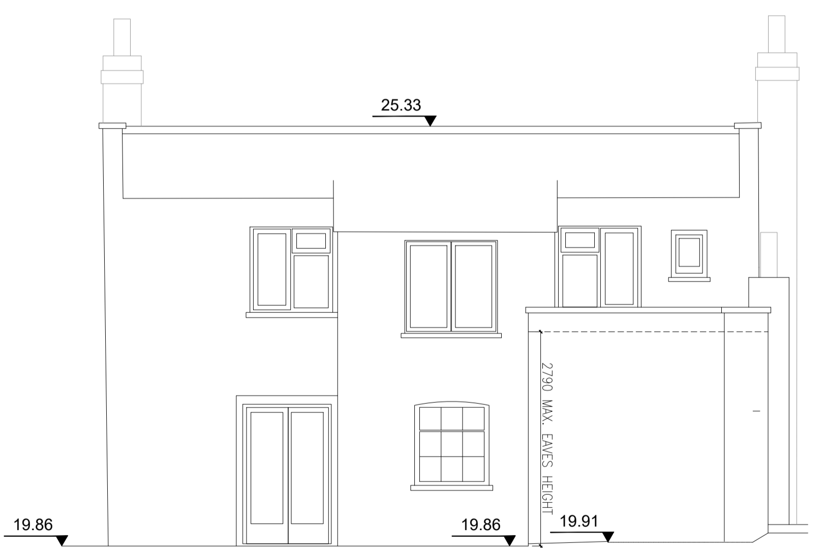
Datum 19.00m North Elevation

02 PROPOSED SIDE ELEVATION GA-011 / 1:500A1